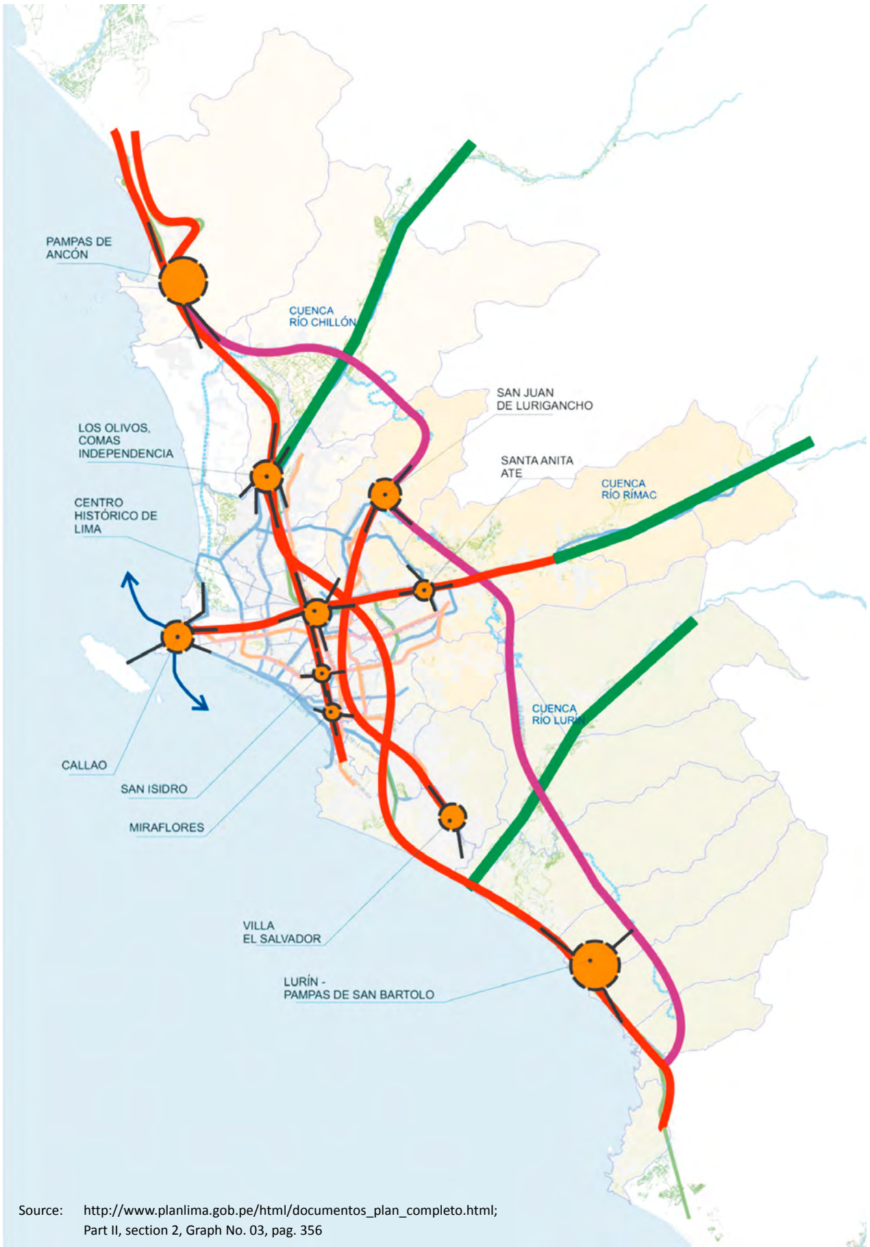
Image 7: MML Lima City Vision: Concerted Development Plan 2012 -2025 Synthesis Map

Source: http://www.planlima.gob.pe/html/documentos_plan_completo.html ; Part II, section 2, Graph No. 03, pag. 356