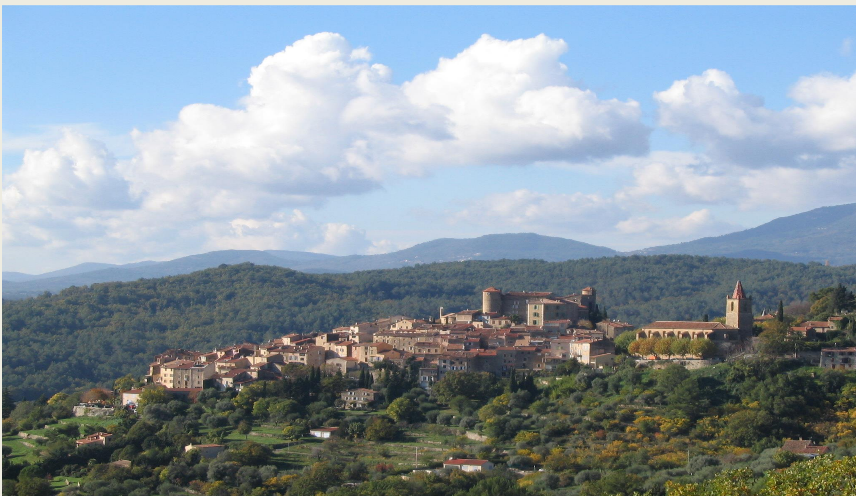
The PV solar farm (below) is located 2 km away from centre of Callian (above), uphill in the forest.