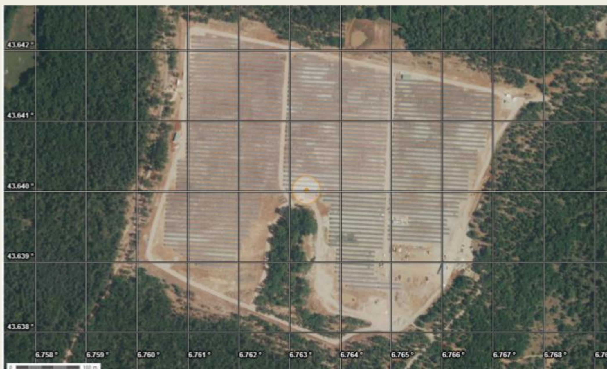
Every rectangle of solar farm represents 0,9 hectares