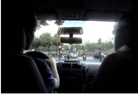
Fig. 1. Filmed driving scene.

A “predicate-arguments” coding scheme was used for comments. This type of coding has the characteristic of being both precise and sufficiently flexible to take account of both the form and content of the comment by using arguments related to the “deepness” of the analysis (Amalberti and Hoc, 1998). “Predicates” coded the shape of the instructor’s comments to capture the degree of student guidance during driving (e.g. delegate, correct, request, etc.). Furthermore, the coding also consisted of two levels of “arguments” in order to take account of the content of the instructor’s comments. The first level coded different information content (e.g. goals, procedures, rules, indicators, etc.) while the second level specified the content of comments relating to the driving activity (see, Appendix A). 7