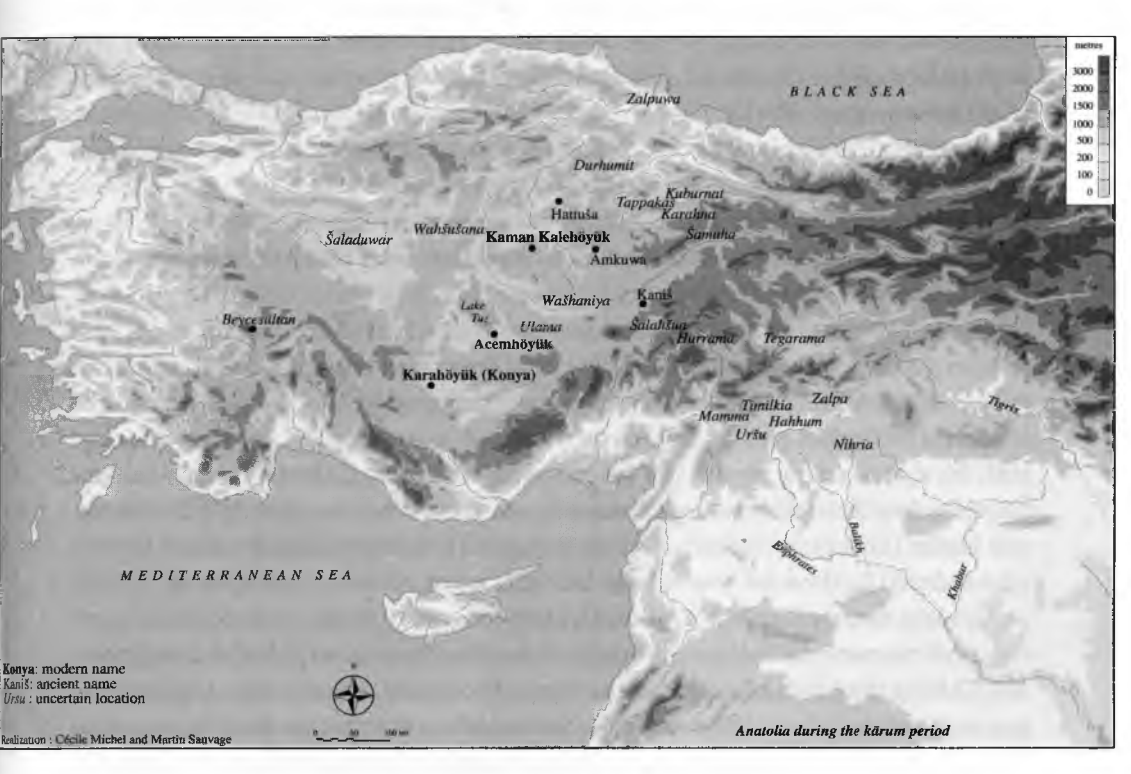
Figure 13.1. Map of Anatolia and Upper Mesopotamia during the kārum period.

The k\bar{a}rum period saw the development of several fortified towns on the main roads showing an organization similar to that of Kültepe: a huge palace as well as