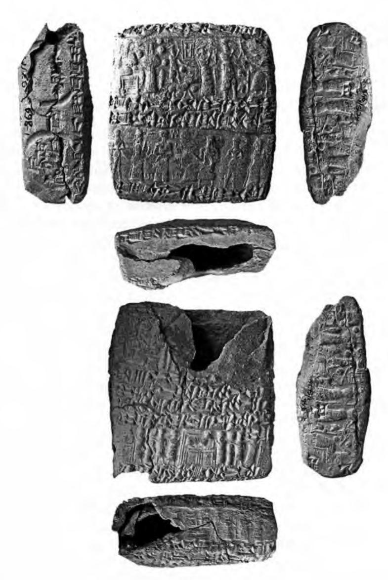
Figure 13.2. Envelope of a loan contract bearing Old Assyrian and Old Anatolian seal imprints (Kt 93/k 941a, Kültepe, Kārum II).