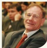
Professor at the University of Paris IV-Sorbonne ; President of the journal Population & Avenir .