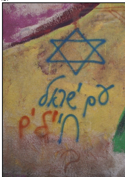
Fig.5 - Double graffiti and play on the words: “am Israel hai” – “am israel haialim” - “the people of Israel is alive” – “Israel is a people of soldiers” – Florentin 2008.

It is one of my arguments that Florentin offers a great arena for capturing the processes taking place nowadays in the Israeli society through a detailed observation and analysis of gentrification, migration, urban activism and of the production of urban identities. The picture reproduced above (Fig. 4) summarizes most of what has been just said and it is one example of a graffiti you can find on many walls of Florentin. Working on globalization, no doubt it is a detail but I suggest taking it as an informative one. It reads “Am Florentin hai”: “the people of Florentin lives” and is written in green and decorated with a