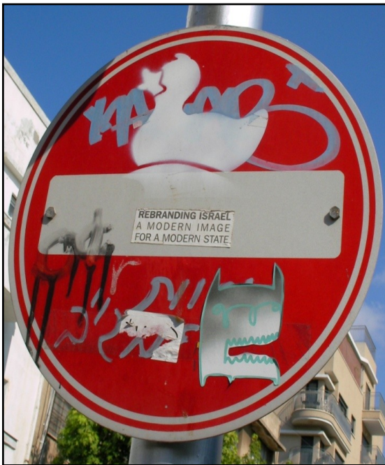
Fig.6 - Sticker “Rebranding Israel. A modern image for a modern state”, Florentin 2008. A call for putting together a new image for Israel from the streets of Florentin.