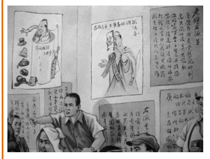
2. Cartoon propaganda produced during the Anti-Rightist Campaign

repeated in the "Resolution" of 1981, in which the campaign was presented as "absolutely correct and necessary," in spite of its "excesses."<sup>17</sup>