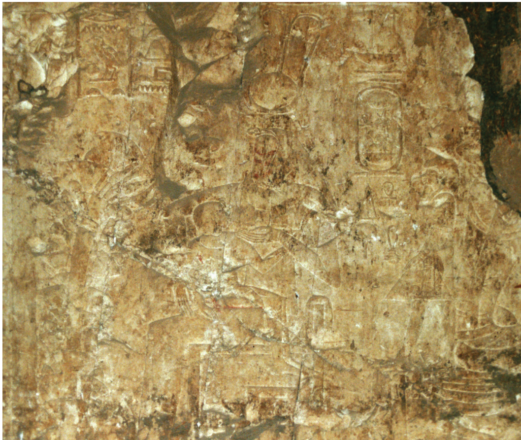
Figure 4. Anthropomorphic nursing image with a snake's face (Theban tomb 48).