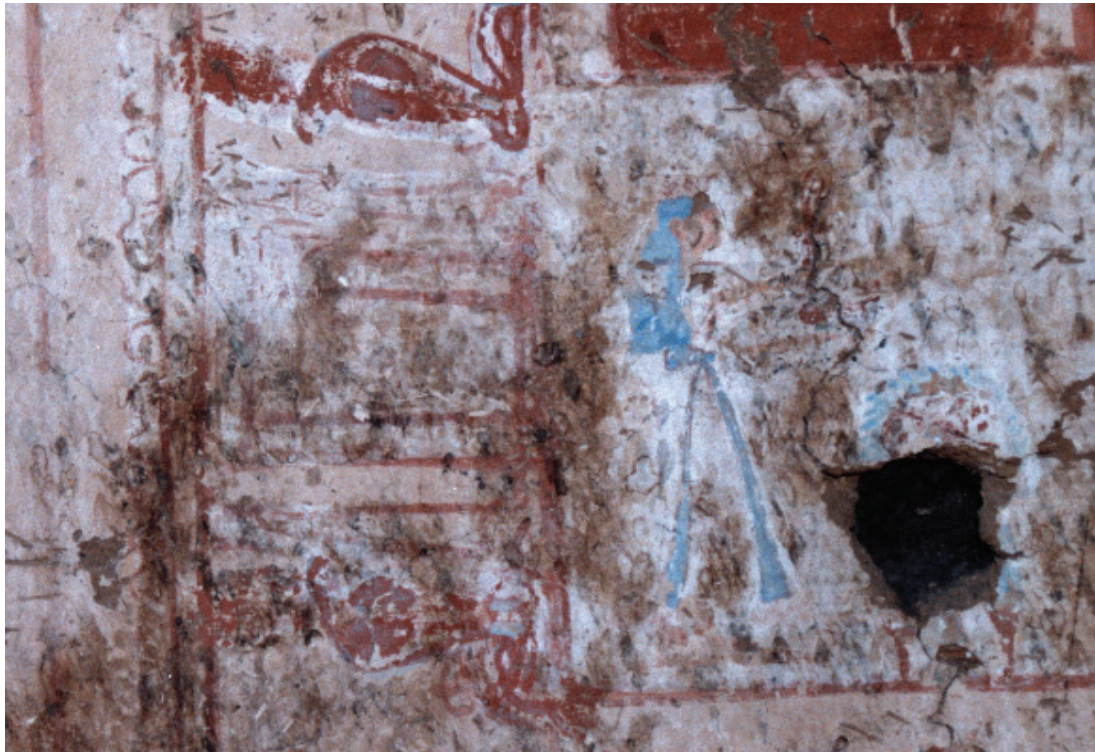
Figure 3. Two anguiform statues with female faces (Theban tomb 284).