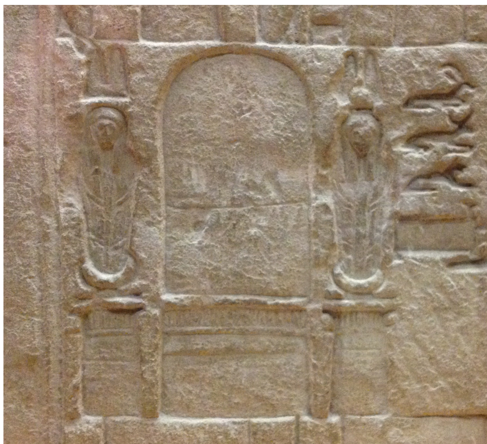
Figure 2. Two anguiform statues with female faces on either side of a stela (detail of the relief Florence inv. 5412).