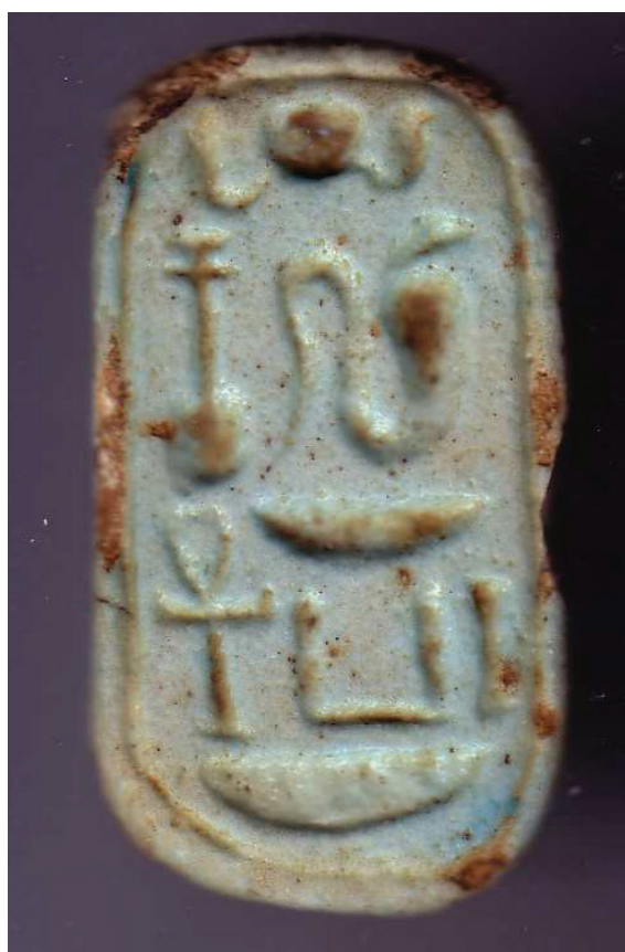
Figure 5. b) Seal (private collection).