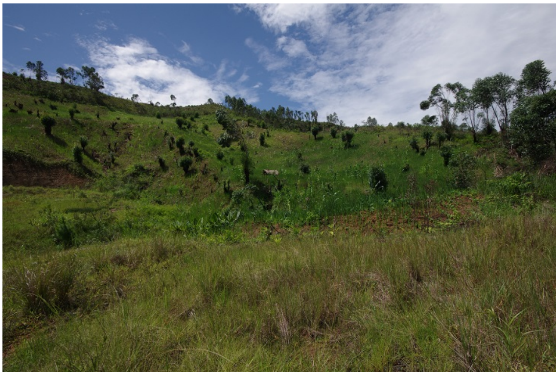
Figure 3: Rice cultivation after eucalyptus plantation

Eucalyptus is known for impoverishing and acidifying soils making them unsuitable for agriculture. Yet, our field visits suggest that some Malagasy farmers clear eucalyptus plantations to grow rice.