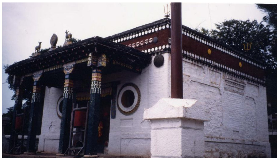
Fig. 10. Gembu-yin süme (Genpimiao, Arqorcin Banner). Temple rebuilt with concrete and baked bricks, concrete pillars painted green.