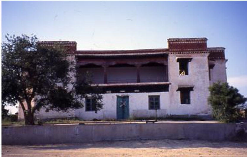
Fig. 4. Balcirud süme (Arqorcin Banner, Chifeng League): an example of temple transformed into housing. The porch has been closed on the ground floor.

has been to negotiate the right of use with the occupying administration, school, factory, warehouse, prison, families, etc., which must be relocated. The rehabilitation of religious sites initiated by the authorities and limited to the main historic and scenic monasteries was soon followed by a growing demand from local communities to reopen smaller temples and monasteries. These demands are granted on a certain number of conditions: local religious leaders may reopen an existing temple or monastery, but not establish a new one (in theory) 34 ; they must constitute a Democratic Management Committee with elected members 35 ; the monastery (or temple) must be economically self-sufficient, located at a famous historical site, in areas where there is a concentration of religious believers and the opening must be approved by the local authorities. 36 The local community is responsible for the buildings' maintenance 37 but is nevertheless required to follow the directives of the Department of Cultural Heritage, Urban Planning and other administrations, and any renovation, reconstruction or extension must be approved beforehand by the aforementioned administrations. Existing structures cannot be demolished. Authorisations are required to set up a business, a restaurant, a shop, or a publishing office. 38 Locally rebuilt monasteries are registered as "cultural heritage."