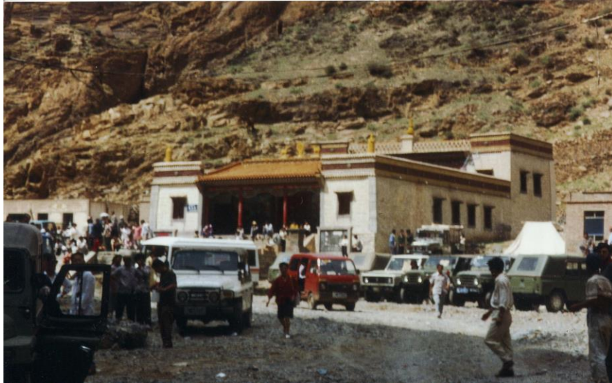
Fig. 3. Festival in Lobunchinbu sūme, summer 1995

for sacred books) and food, and in return receive blessings, sacred water and herbal remedies. They buy wind-horse flags which they hang on the northwest side of their yurts. 32 Private consultations also take place inside the monks' cells. In the courtyard of the monastery itself, the monks were selling the gifts they had just received (prayer rugs, debel )! An unusual feature is the presence of meat offerings (mutton) on the altar of a lateral shrine.