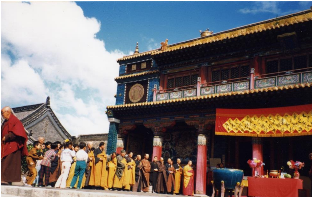
Fig. 2. Festival in Siregetü juu, summer 1995, with Chinese heshang and lay believers, summer 1995.

The five-day festival of Aršan sūme attracts herdsmen from all the surrounding countryside. According to Alexandra Marois, a French anthropologist who attended the festival from September 19 th -24 th , 1999, the monks insist on the importance of walking the last few kilometres to the monastery (it is the first question they ask visitors upon their arrival). Most visitors come for just one day. No Chinese attends the festival. The pilgrims circumambulate the monastic complex turning their prayer-wheels, prostrating and making libations with baijiu (Chinese distilled sorghum alcohol), some bearing sacred books on their backs. They offer hand-sewn coloured nom-un debel (cloth-covers