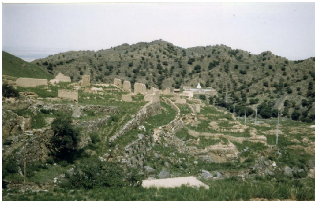
Fig. 9. Barayun keyid, ruins.

stupas are frequent. Metal-sheet roofing (previously unknown in Inner Mongolia) may be seen in Baryu (Kölün Buir)—perhaps owing to the influence of certain religious edifices in Ulaanbaatar.