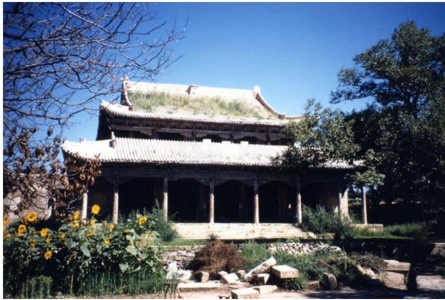
Fig. 5. Fanzongsi (Ongniyud Banner, Juu uda league, now in Chifeng league): an example of protected mummified monastery