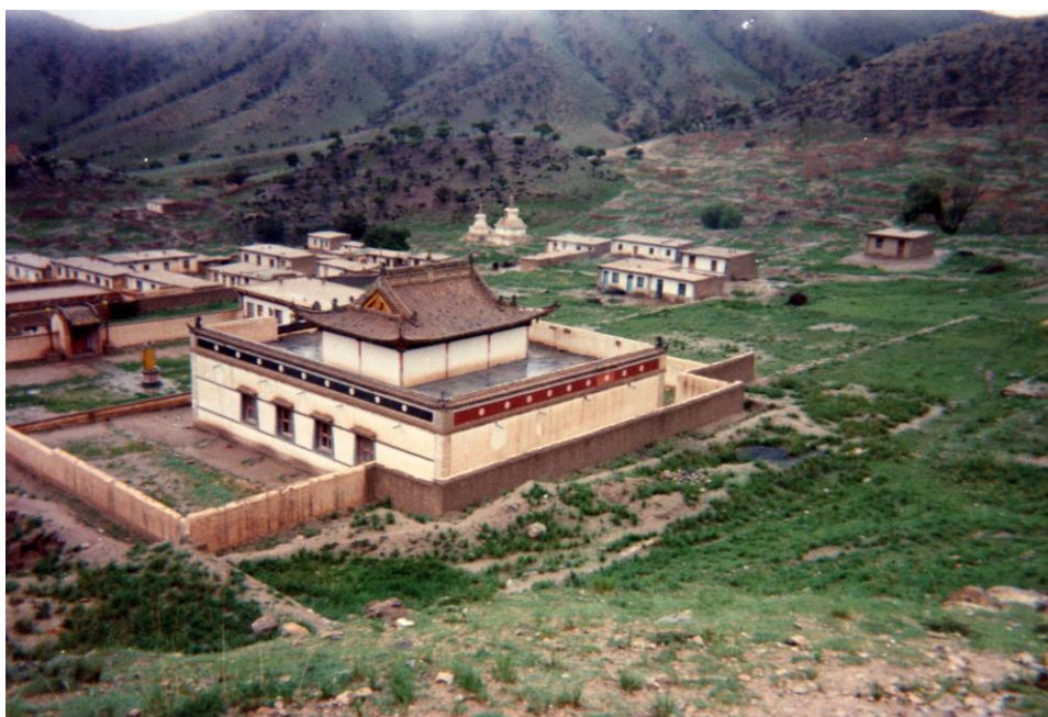
Fig. 8. Barayun keyid (Helanshan nansi, Alashan Left Banner, in the Helanshan mountains): assembly halls are rebuilt in front of the ruins.

Since there is no information available on the exact number of non-official, locally rebuilt monasteries and temples, I can only describe the places I visited, which I hope will nevertheless give an idea of the diversity of conditions and alternatives. In 1981, twenty monks (several of whom have studied in Amdo) together with a group of local laymen began to collect funds to rebuild the famous Barayun keyid (Alaša), which formerly housed the funerary stupa of the Sixth Dalai Lama. 56 Although the stupa was destroyed, the monastery has remained one of the most sacred sites in Alaša. (Fig. 8, Fig. 9) The assembly halls of Jegün keyid and of Lobunchinbu sūme (one of the few Nyingmapa monasteries in Mongolia) have also been rebuilt on the ruins of the previous sites, together with seven other monasteries in Alaša.