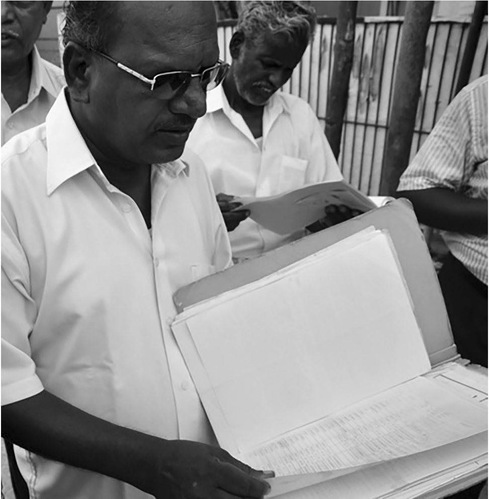
The Resident Association President presenting a folder of petitions, official registration of claims, newspaper cuttings and sketch maps in September 2011.