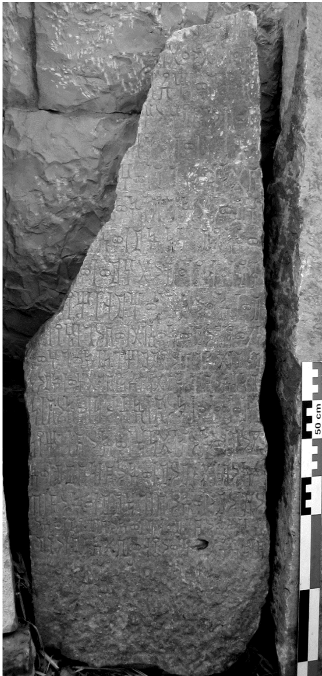
Figure 2: Inscription Jabal Riyām 2006-17.

The unknown authors of the text give thanks to Ta'lab Riyām, the main deity of the tribes of Ḥāshid and Ḥumlān in his sanctuary on the Jabal Riyām, in order to gain the favour of their lords of the lineage of Bata' as well as fruitful crops and harvests. They follow the common format of a dedication usually made to this deity.