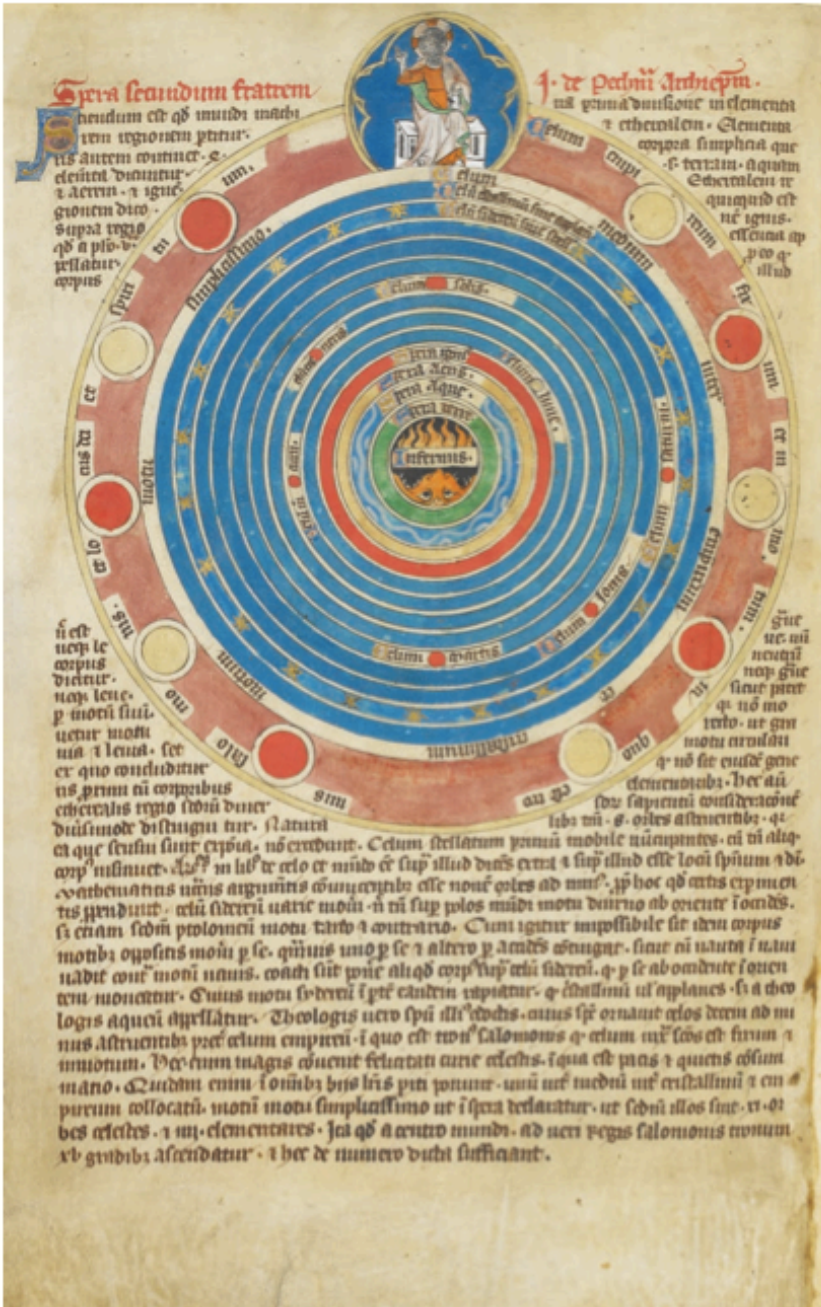
Fig. 5 A table of spheres, based on the introduction to John of Peckham's Tractatus de sphaera . From the De Lisle Psalter , England, c. 1310, Arundel MS 83, 123v.