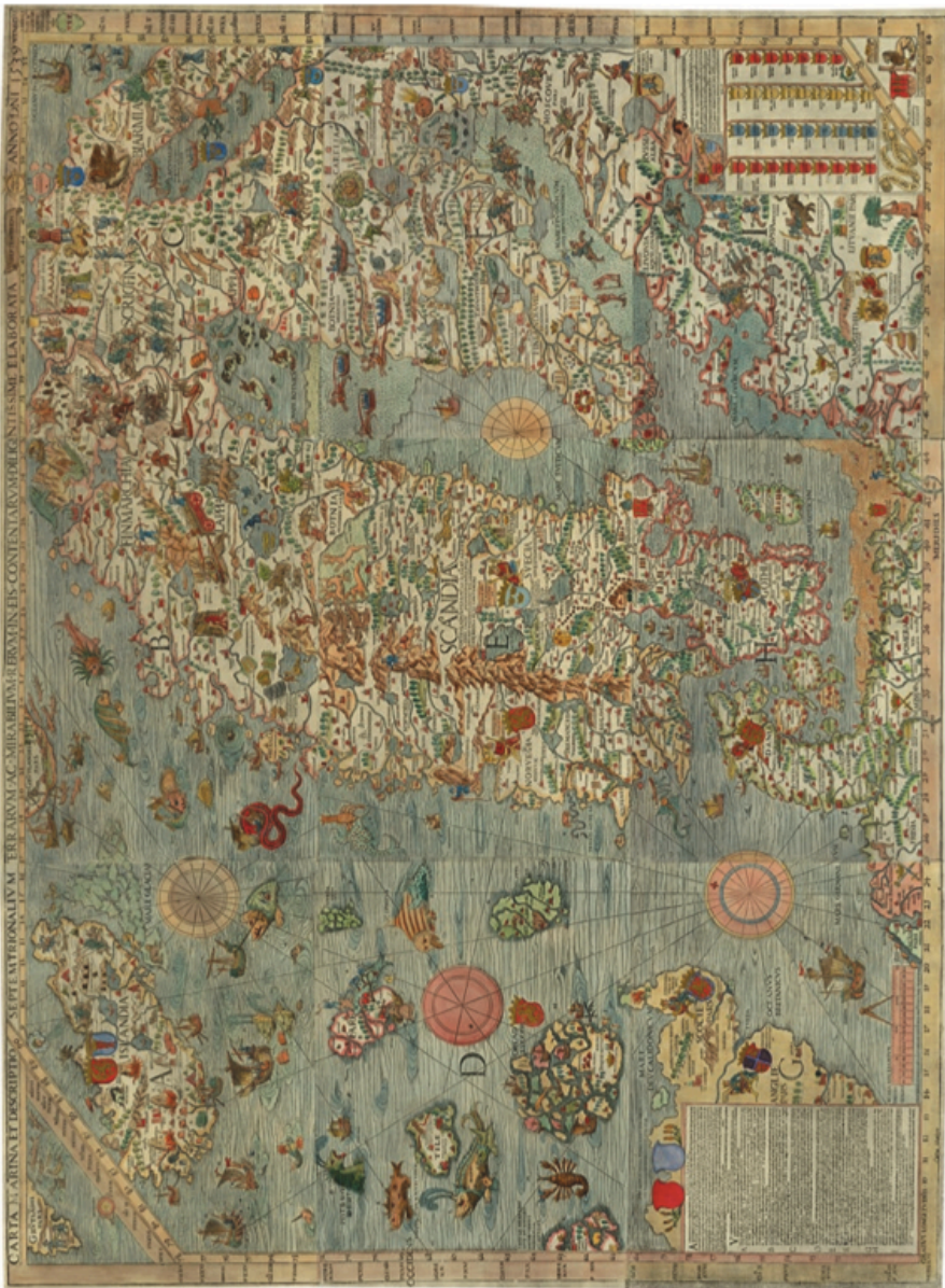
Fig. 2 Olaus Magnus, Carta marina et Descriptio septemtrionalium terrarum ac mirabilium rerum in eis contentarum , diligentissime elaborata Annon Domini 1539 Veneciis liberalitate Reverendissimi Domini Ieronimi Quirini, Venice, 1539.