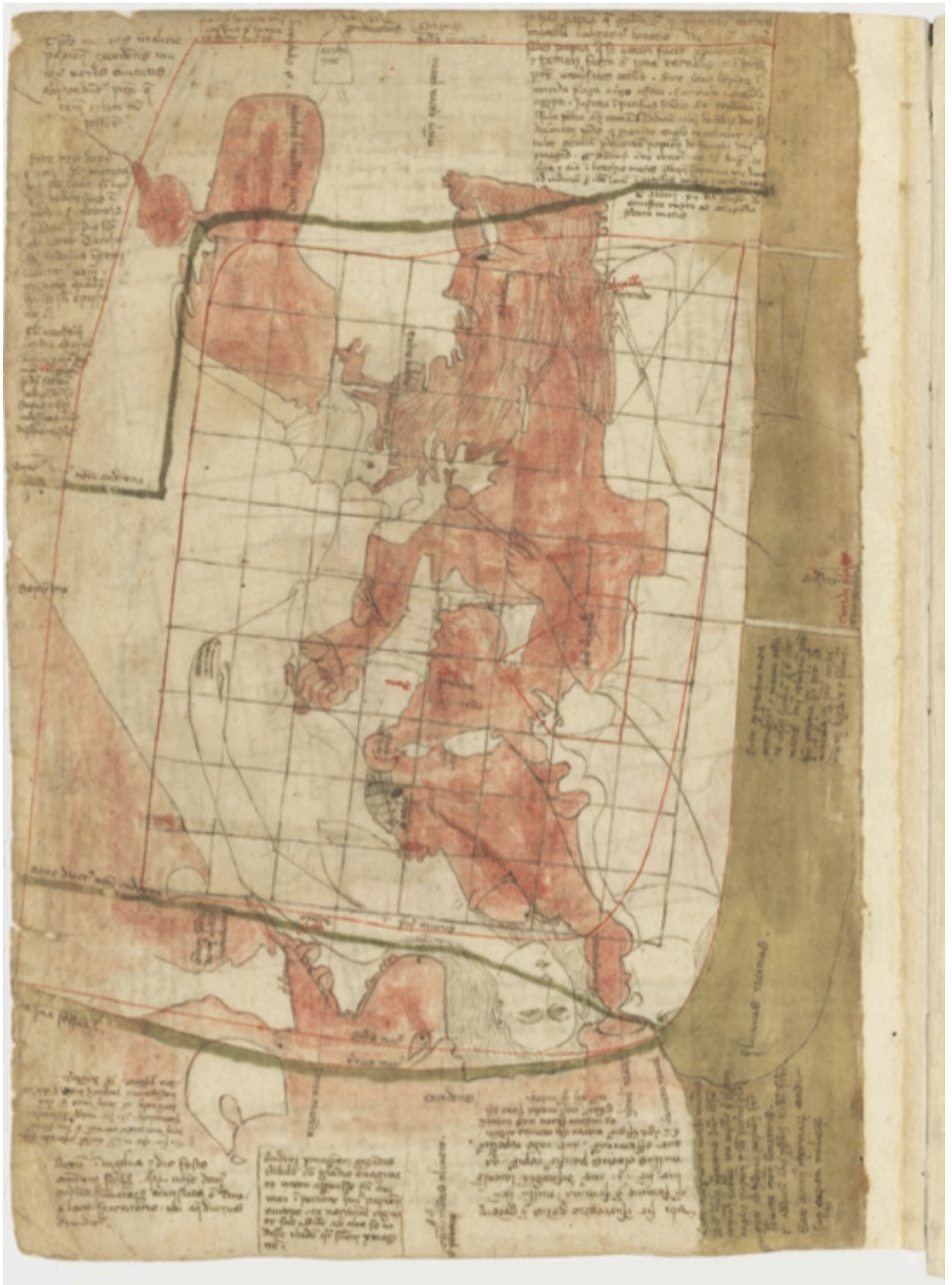
Fig. 7 Opicinus de Canistris, Mappe , 1296, Vaticanus latinus 6435, f. 84v.