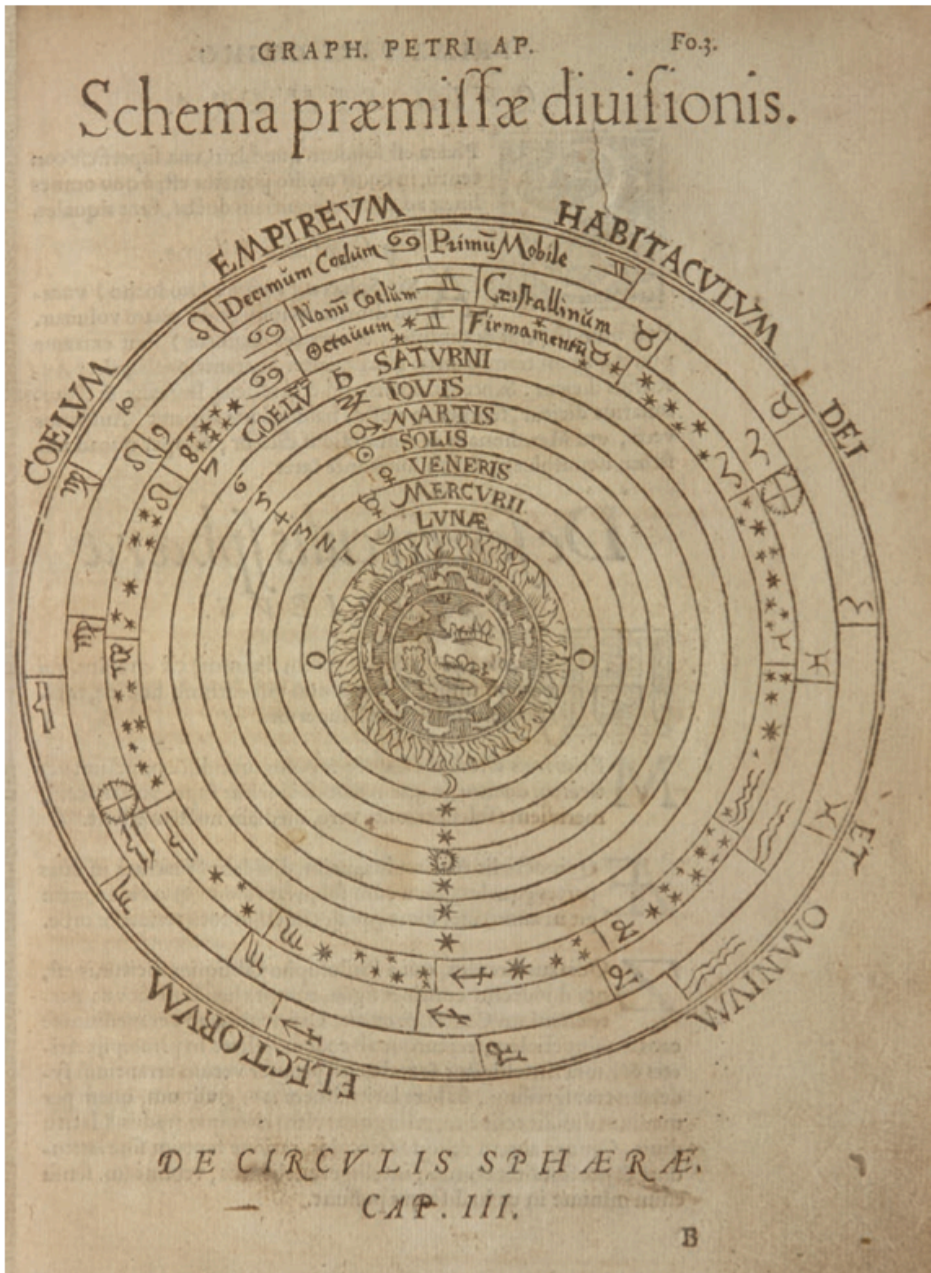
Fig. 4 Peter Apian and Gemma Frisius, Cosmographia , Antwerp: Gregorius Bontius, 1550, f. 3r.