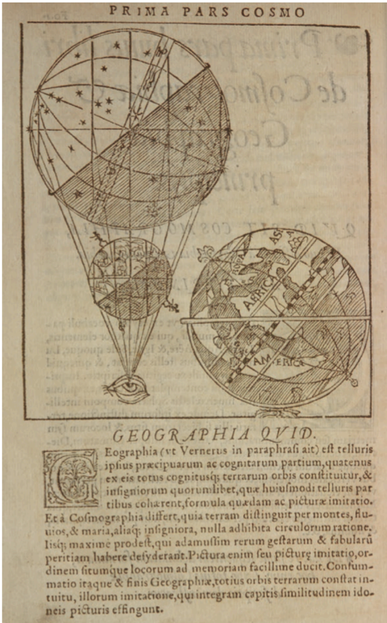
Fig. 3 Peter Apian and Gemma Frisius, Cosmographia , Antwerp: Gregorius Bontius, 1550, f. 1v.