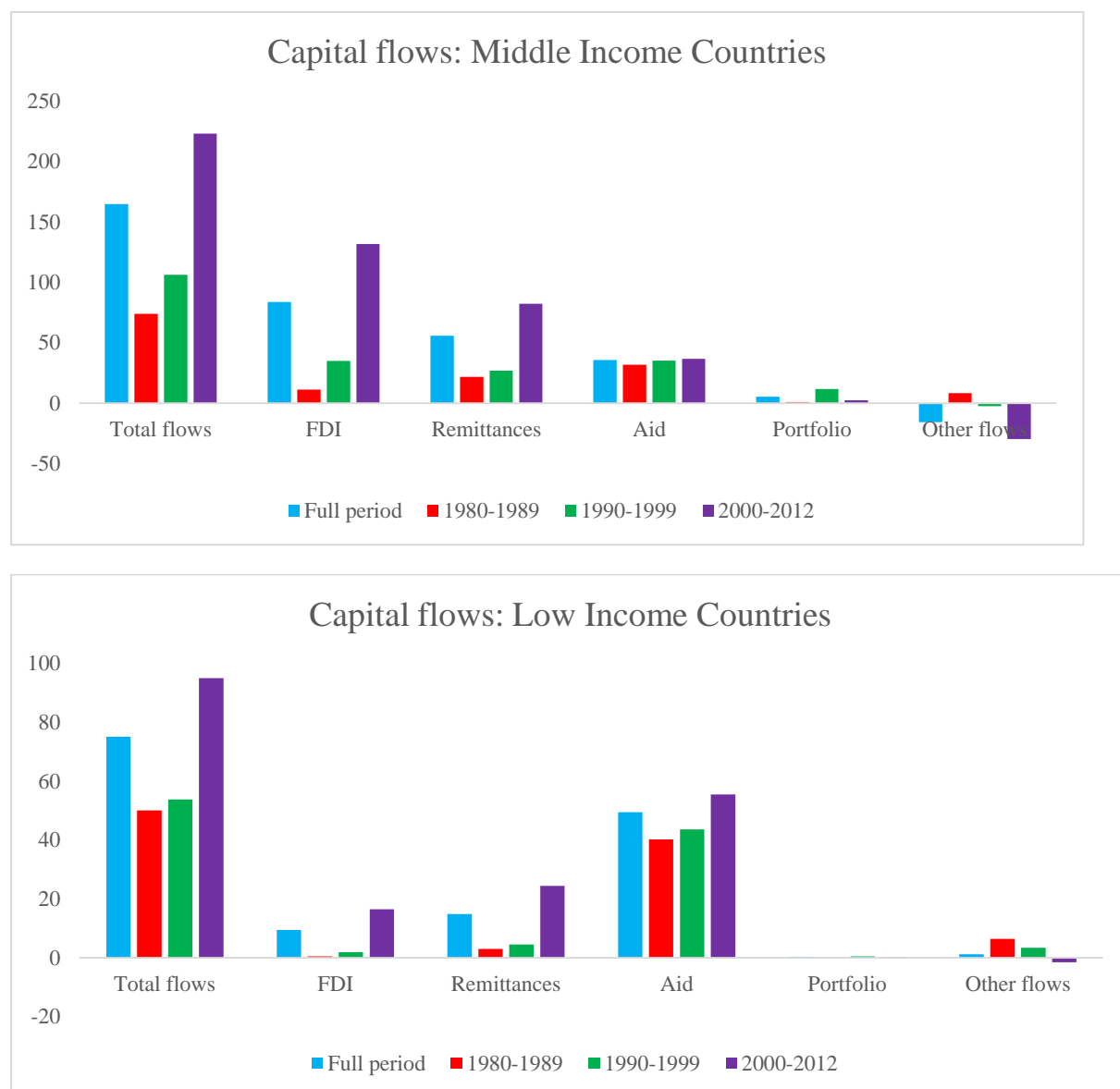
Figure 1: Per capita total net capital inflows and their structure (current U.S. dollars)