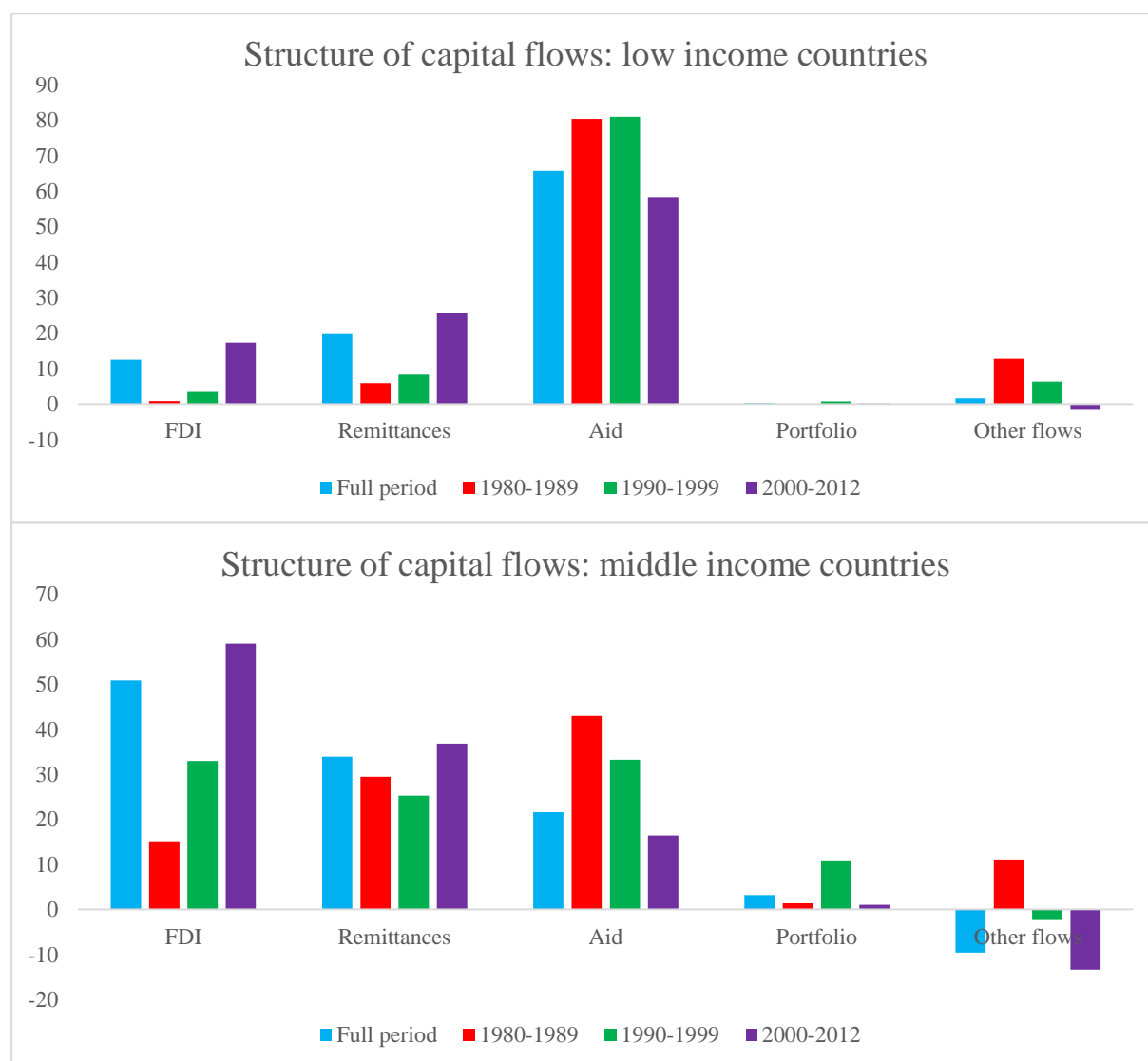
Figure2: Total net capital inflows and their structure (%)

development, official aid constituted the bulk of the inflows. It accounted for about 40 percent of the total financing for the MICs, and 80 percent for the LICs, more than remittances, the second largest category. In relation to the decreasing role of aid, the composition of ODA has also changed dramatically to a larger proportion of grants than loans. ODA flows are now focused primarily on LICs and on extending human capabilities, especially through health or education expenditures, rather than directly supporting productive investments or hard infrastructure as was the case during the 1980s.