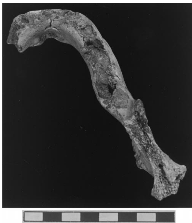
Fig. 3. Aubesier 11 mandible in superior view. Scale in cm.

Aubesier 4 consists of most of the crown and root of a moderately worn left I 2 , and Aubesier 10 is a slightly worn right M 1 or M 2 with minimal marginal postmortem erosion (Fig. 2). The Aubesier 11 mandible (Figs. 3–5) is largely complete from the left C 1 alveolus to the right condylar margins, but it has lost most of the coronoid process and sustained minor damage to the symphysis and the right gonial region. There is little damage to