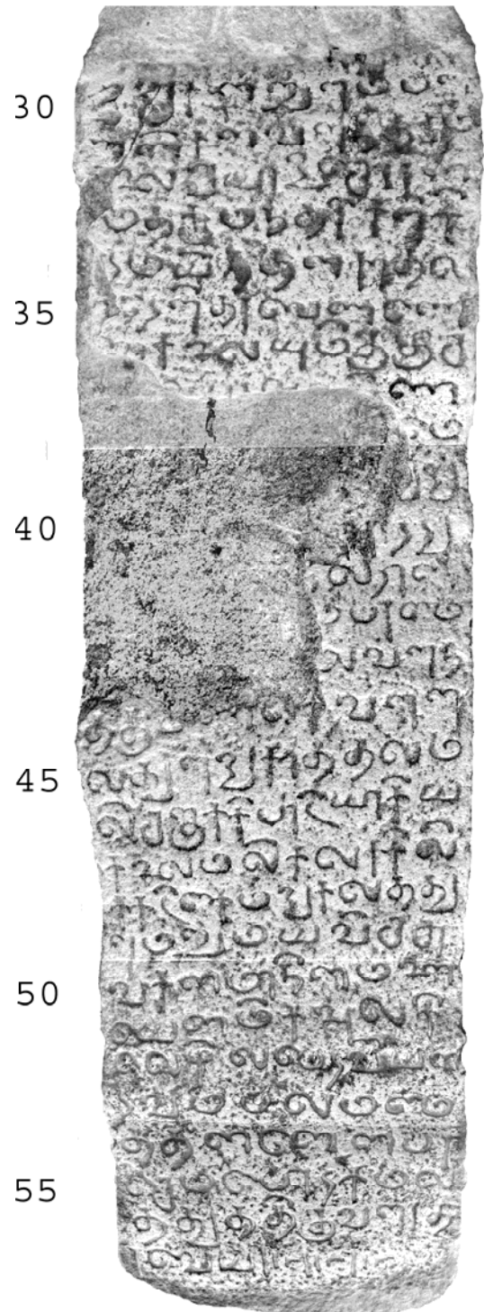
Fig. 5: Caṅikkavāṭi pillar inscription, front face, i.e. lines 30-57.