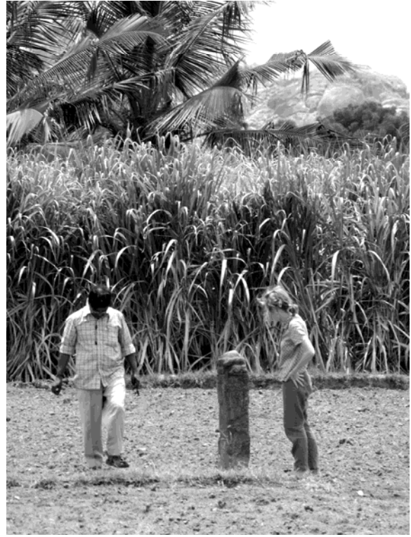
Fig. 2: Caṅikkavāṭi, pillar in a field with inscription dated to the 25 th regnal of the Rāṣṭrakūṭa king Kṛṣṇa III (EI XL, No. 9).