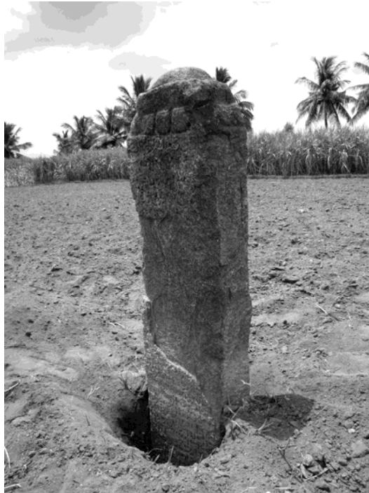
Fig. 3: Caṅikkavāṭi pillar inscription, front face.