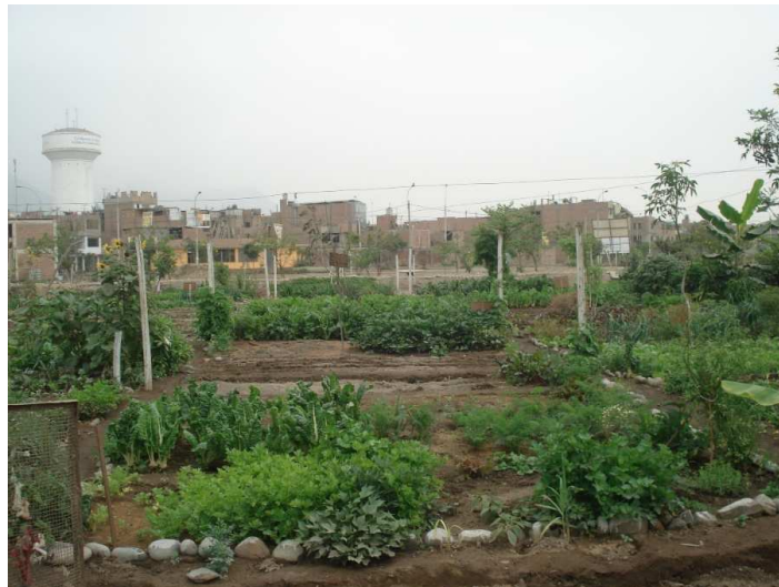
Figure 3: Shared garden in Comas

In the foreground, various horticultural plants: celery, Swiss chard and fennel. In the background, residential area of Comas, suburban area north of Lima.