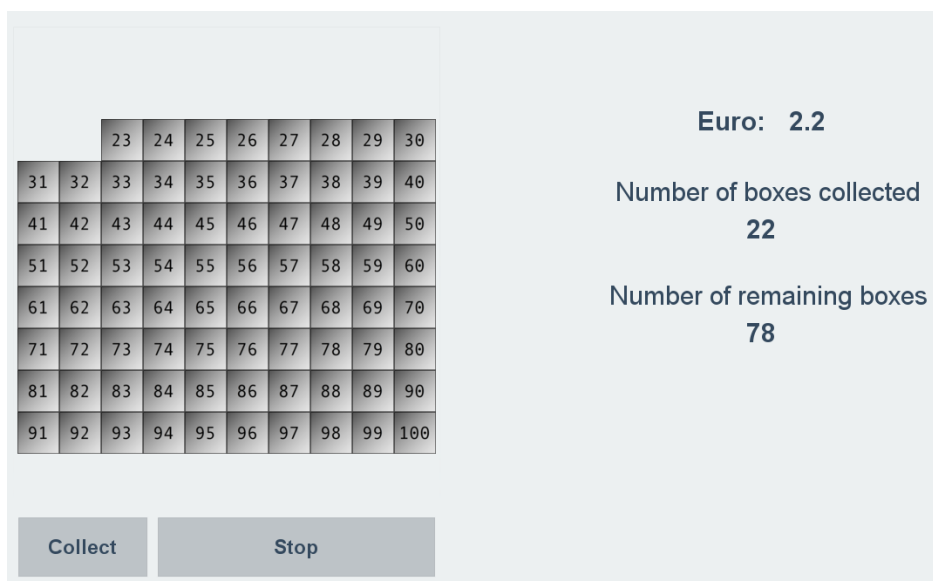
Figure 1: The BRET interface after 22 clicks

The position of the time bomb b \in 1, 100 is randomly determined after the choice is made by means of a draw from a uniform distribution over the support [1, 100] . Calling k the number of boxes collected, if k_i^* \geq b it means that subject i collected the bomb, which by exploding wipes out the subject's earnings. In contrast, if k_i^* < b , subject i leaves the minefield without the bomb and receives 10 Euro cents for each box collected. The metaphor of the time bomb allows to implement a choice in strategy method, avoiding the truncation of the data that would otherwise happen in case of a real-time notification like for instance in the Balloon Task (Lejuez et al., 2002).