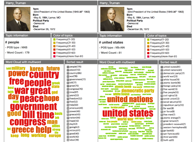
Figure 3: Analysis result of Harry Truman's speech by (a) unigram and (b) bigram.

We conducted case studies to evaluate the effectiveness and usability of our system. We worked with computational linguistics researchers who study multiword topic analysis and have expert knowledge of it. They used our system to find information about their research questions.