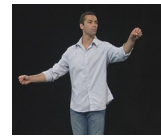
Figure 8: “Grasping essentials” with the zero article

Although artificial in form and pedagogical in function, the gestural action does not differ significantly from other types of gestural expression, since it uses the symbolic resources of the human body , which can just about represent anything, abstract or concrete, through attitudes, expressions and movements in multidimensional space. What is more, the actual physical moves made during “ kinegrammatic performances ” are based on the standard repertoire of metaphoric gestural activity of the IBC. Thus, the manual symbol for “ grasping essentials ” – a gestural metaphor used to characterize the zero-article in English (e.g. \emptyset Life... \emptyset Beauty... \emptyset Silence... ) – is little more than a physical instantiation of a common metaphor, entrenched in lexical usage. The grasping hands in the short, poetic kinegrammatic piece in Figure 8, belong both to the performer (as physical hands) and to the IBC (as HANDS that can interact symbolically with words and meaning in abstract grammatical space).