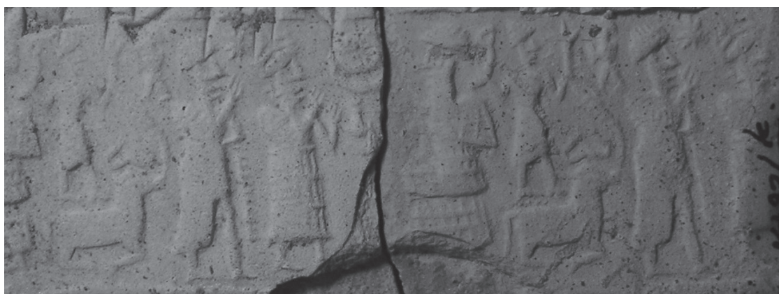
Fig. 4: imprint of Tariša's seal on the envelope of a letter she sent to Kaneš (Kt 93/k 372+380).