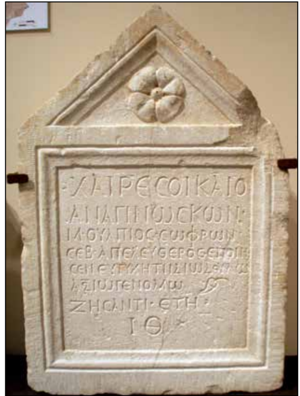
6. Epitaph of the slave Eutyches, from Jarash, ancient Gerasa, early 2nd century AD.

sculptor's signatures in the Near East. The white marble was quarried on the island of Thasos, according to an analysis (Friedland 2001: 471). Another inscription shows the signature of the same sculptor on a base that probably supported the statue. Donderer (2001: 178-179, no 7 [SEG 51, no 2048]) published the last two lines: Ἀντονῖνος Ἀντιόχου Ἀλεξανδρεὺς | ἠργάσατο. The full text of this second inscription was published in capital letters by Weber (2004: 226). It is a dedication of a statue offered by a Gerasene, Lysias, son of Ariston, to the city of Gerasa, his homeland, in the year 181 or 281 of the Gerasene era (118 / 119 or 218 / 219 AD). According to Weber (2004), the first date would fit more accurately with the slight remains of the hundreds digit. Without knowing of the second inscription, and based only on stylistic comparanda of the statue and of the shape of the letters, Friedland (2001, 2003) suggested that the statue was sculpted in the late second or early third century AD. The personal names of the donor, devoid of Roman influence, are more consistent with Weber's hypothesis.