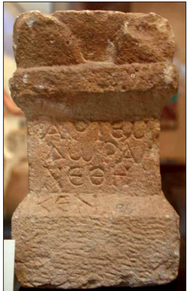
4. Dedication from Jarash, ancient Gerasa, Roman imperial period.