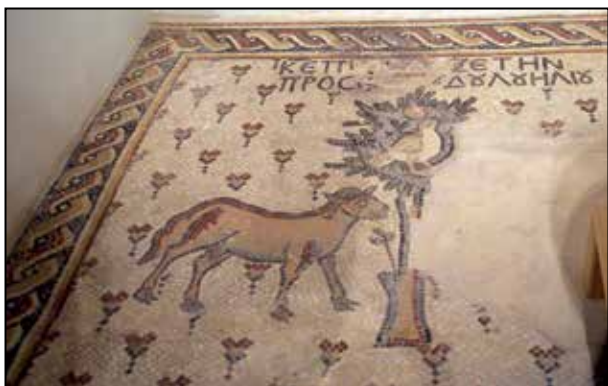
7. Mosaic dedication from Kfayr Abu Sarbut church (al-Khattabiyya), near Madaba, Byzantine period.

Elias was one of the most popular names in the Madaba region and in the whole Near East during the Byzantine period. See above, no 2.