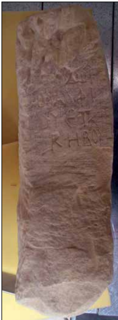
10. Epitaph of Theodoros, son of Alphios, from Petra region, ca 2nd / 3rd century AD.

The Greek name Theodoros is as common in