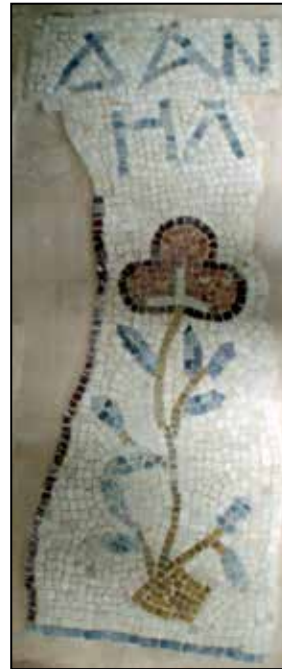
3. Mosaic from Khirbat Daraiyya church, Byzantine period.