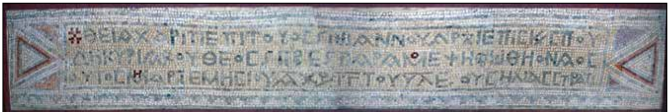
2. Mosaic dedication from al-Husn church, 535 AD.

† Θεία χάριτι ἐπὶ τοῦ ὁσ (ιωτάτου) Ἰωάννου ἀρχιεπισκ(όπου)σπου|δῆ Κυριακοῦθεοσ(εβεστάτου) πρε(σβυτέρου) (καὶ) παραμο(ναρίου) ἐψηφώθη ὁ ναὸς| οὗτος μη(νι) Ἀρτεμησίου ἀ', χρ(ονοῖς) ἰγ', τοῦ υλ' ἔ[τ]ους Ἡλίας στρατ(ῶν).