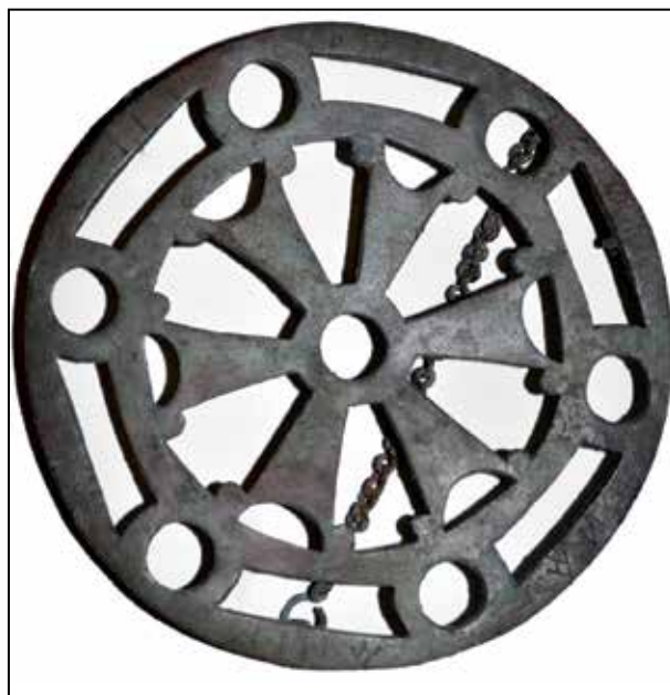
8. Christian Inocation addressed to Saint Sergios on a polycandelon, from Umm ar-Rsas, ancient Kastron Mephaa, Byzantine period (photo courtesy of the Jordan Museum).

This object belongs to a well-known series of lamp-bearers, common in Near Eastern Byzantine churches. The so-called ‘church of the rivers’, where it was discovered, must have been dedicated to Saint Sergios. The cult of Saint Sergios, martyr in Sergiopolis (Resafa in Syria), was widespread in the Byzantine provinces of Arabia and Syria. Thomas donated the object.