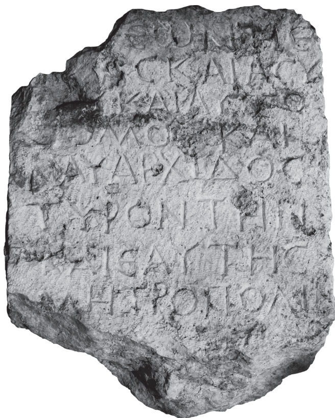
Figure 12.3. Dedication of the statue of Tyre by the Laodiceans, Tyre.