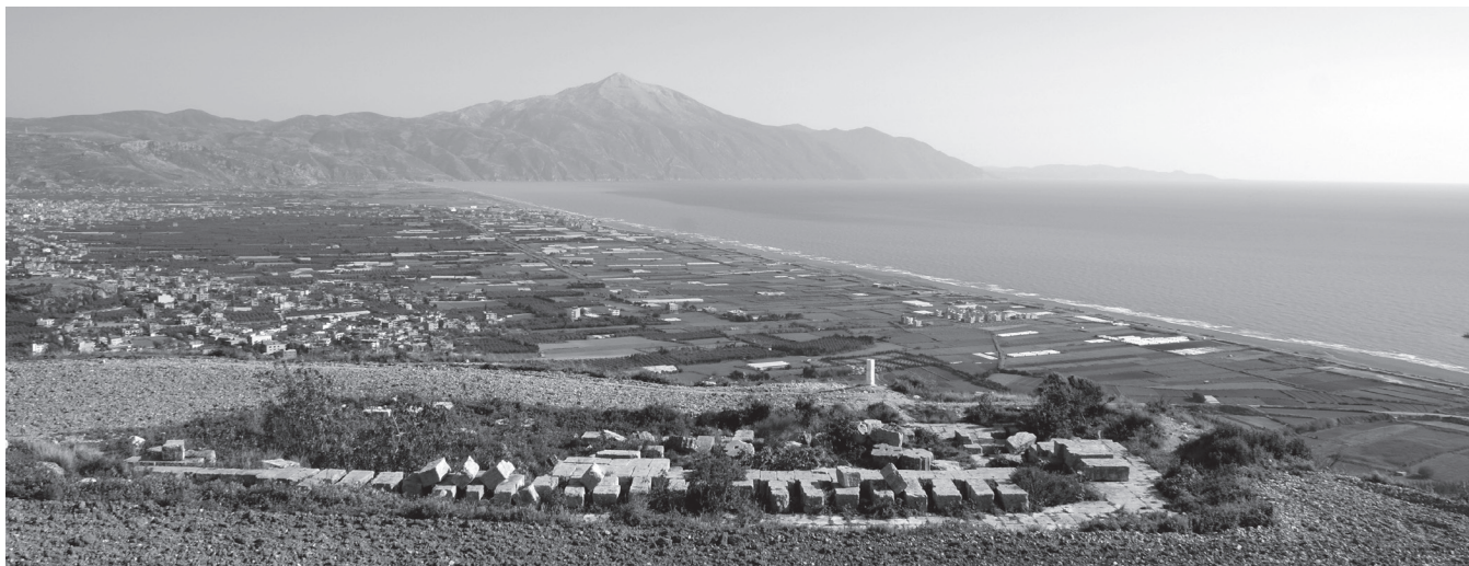
Figure 12.1. Mount Casius seen from the site of the Hellenistic Doric temple at Seleucia.