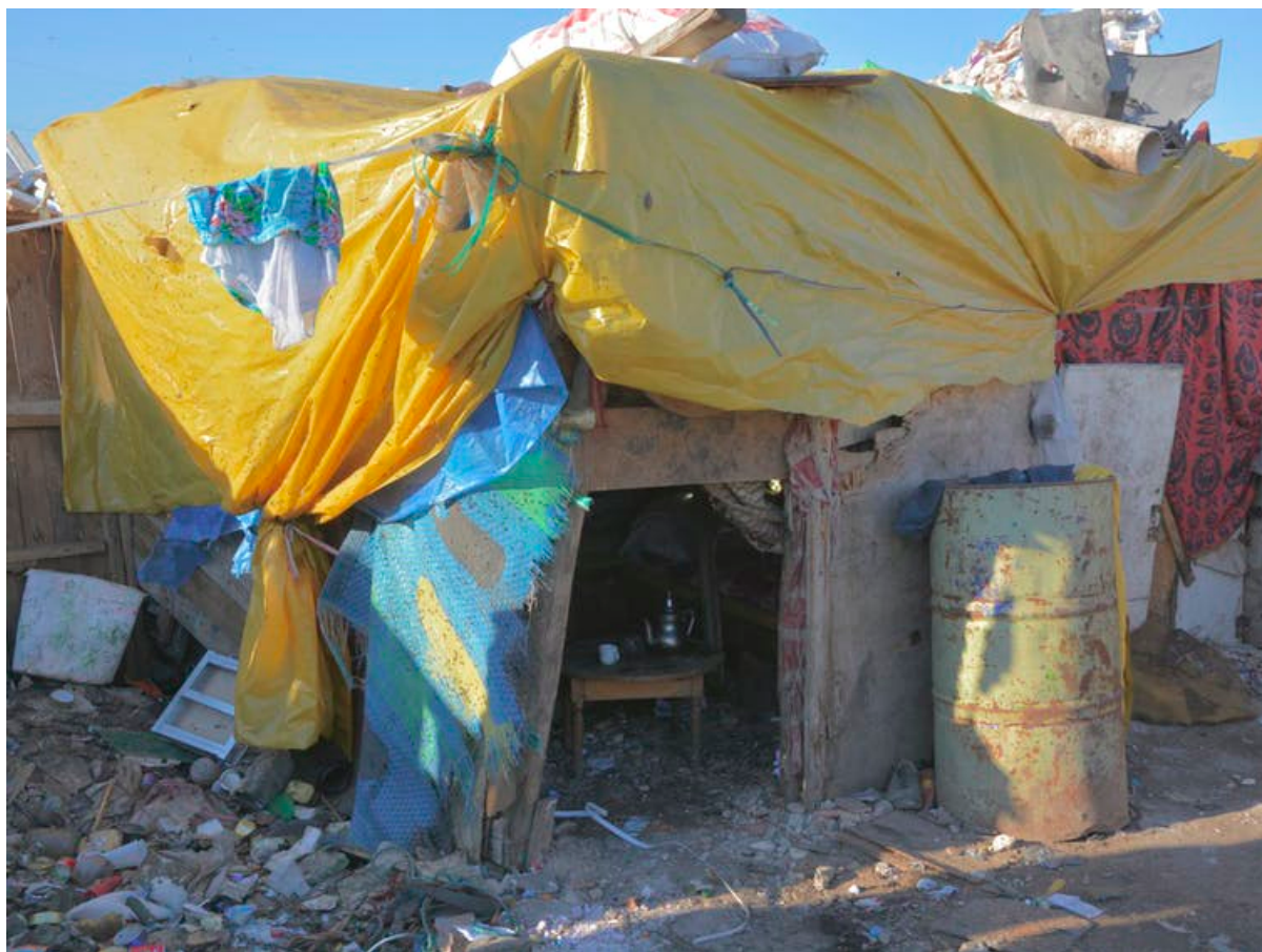
The sheds of waste collectors are themselves made with waste. (Photo Pascal Garret, January 2015)

Waste collectors come, for the most part, from the countryside to escape poverty. Some of them originate from very remote villages in the eastern regions of Casablanca.