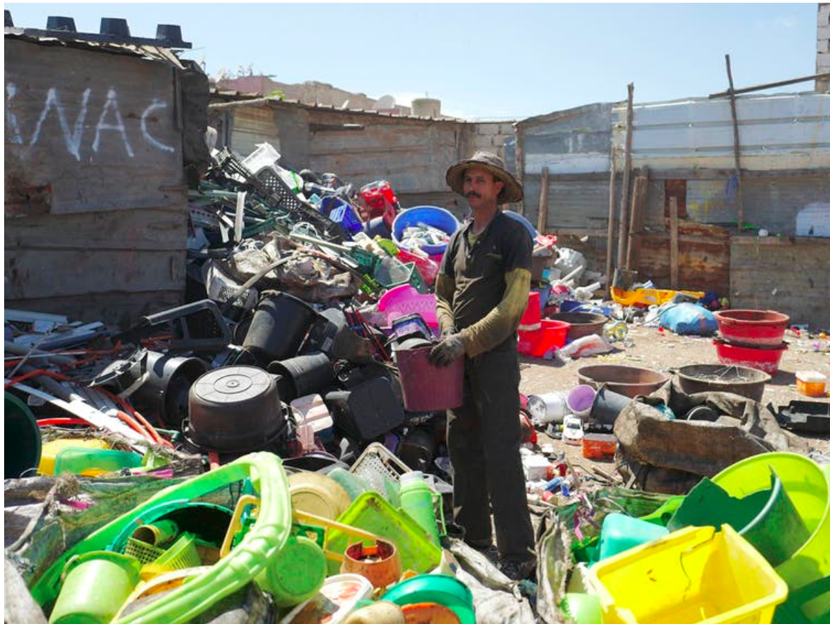
A worker sorting waste in a gelssa specialised on plastic materials.

Their collection is sold by weight and consists mainly of cardboard, plastics, metals, glass, fabrics and vegetable waste. Valuable objects, after changing hands several times, will eventually end up in one of the city's flea markets ( joutiya ). Nothing that can be used is left behind.