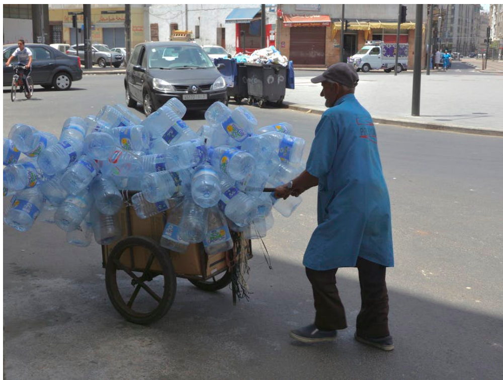
A wastepicker working in the streets of Casablanca.