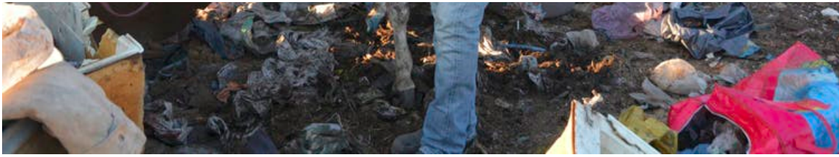
The boss of a gelssa posing with his horse.

This boss of a gelssa employs several waste collectors. He owns a few carts pulled by a donkey or a horse, and is a “middle-income earner”.