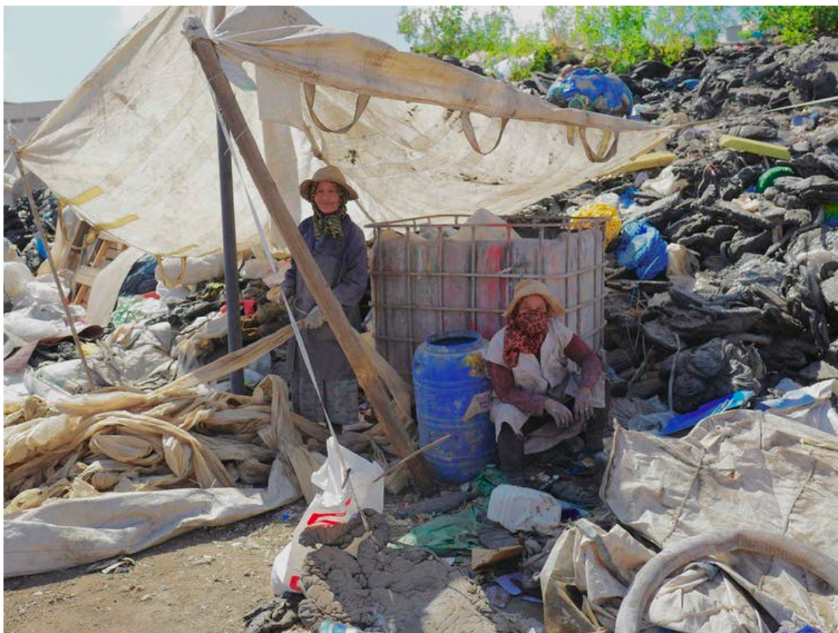
Women sorting plastic waste.

After collection and sorting, some materials have to be compacted and crushed to take up less space, which adds value. The materials will then be sold to informal sector wholesalers or to the formal sector through pick-ups or trucks sent to carry the waste.