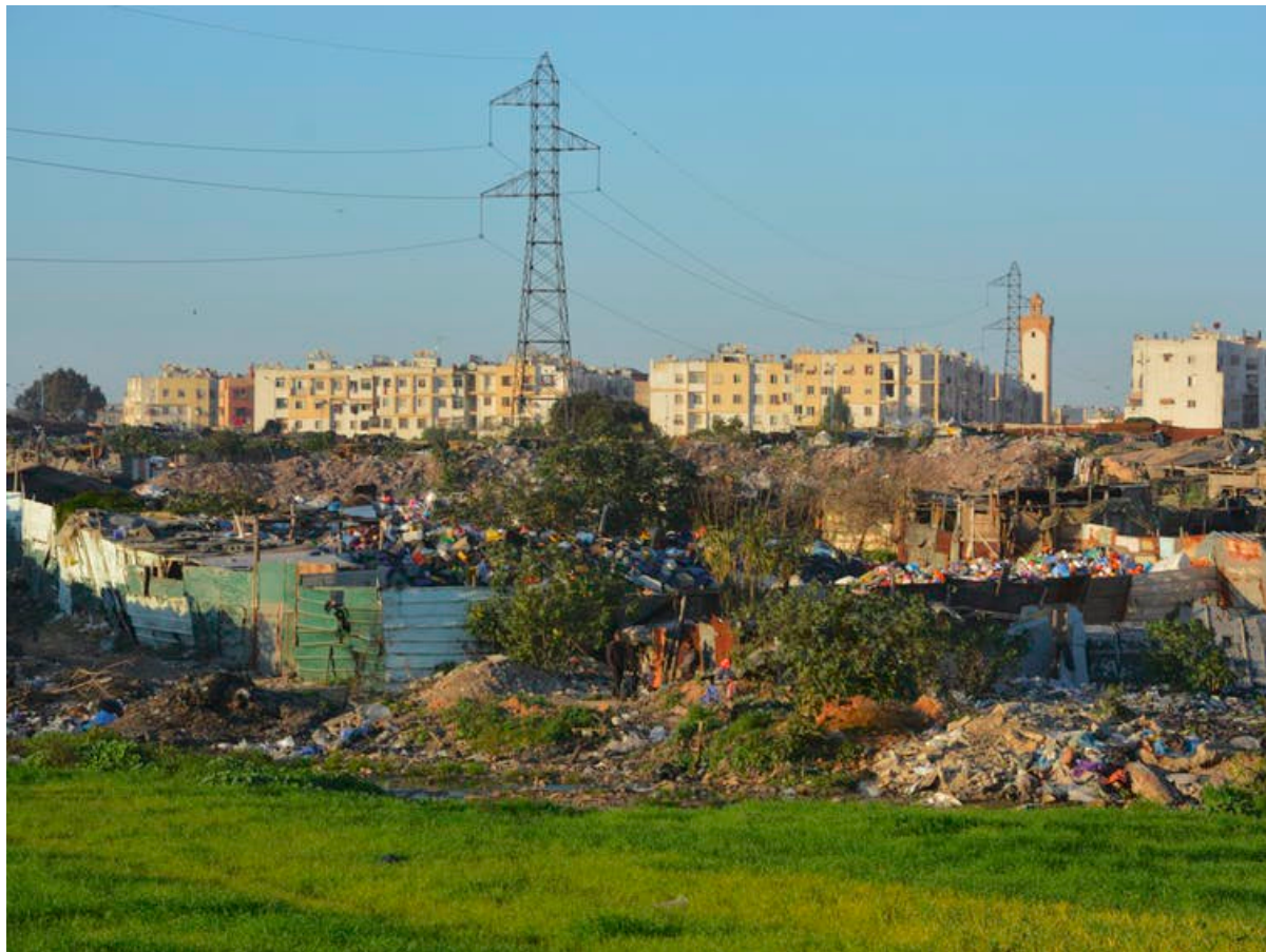
Overview of one part of a waste recycling area in Casablanca, Lahraouine. In the background, you can see the social housing district of Attacharouk. (Photo Pascal Garret/MuCEM, January 2015)

Far from presenting an image of misery and exclusion, we wish to portray this population free from the stigma that usually accompanies activities linked to waste.