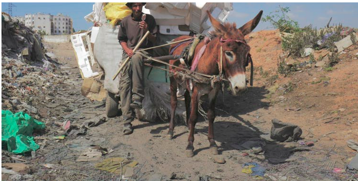
A bouar returning from his tour in the outskirts of Casablanca.

This bouar (the word is derived from the French word éboueur for garbage man) returns from the city with a cart filled with his daily collection. But the increasing number of containers buried in the affluent neighbourhoods of Casablanca reduces access to this waste resource.