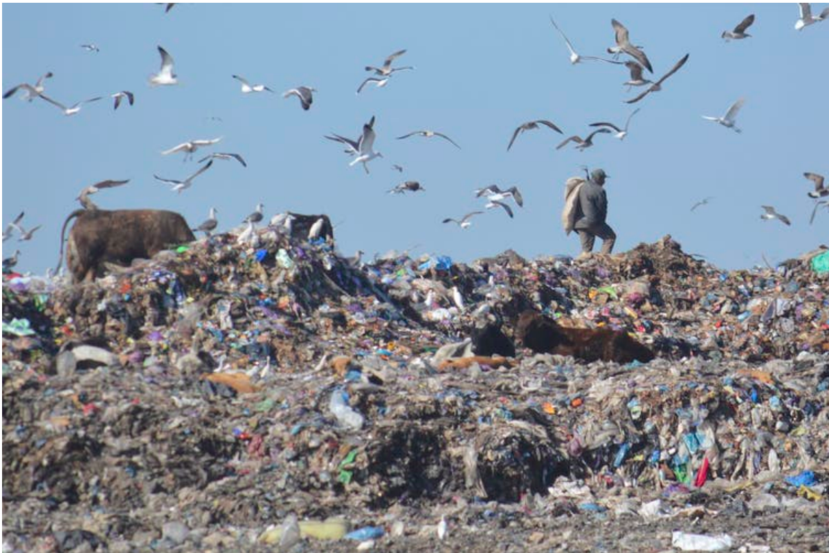
A waste collector at work in the Mediouna dump. (Photo Pascal Garret/MuCEM, January 2015)

Gelssas bosses are very familiar with the cost and value of materials on the market and keep themselves updated through the internet or their mobile phones. They know exactly where, to whom and when to sell to get the maximum benefit from their wares.