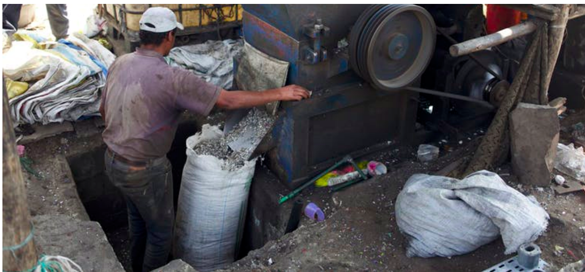
There is no electricity in the gelssas and this machine is powered by a generator. (Photo Pascal Garret, April 2017)

After collection and sorting, some materials have to be compacted and crushed to take up less space, which adds value. The materials will then be sold to informal sector wholesalers or to the formal sector through pick-ups or trucks sent to carry the waste.