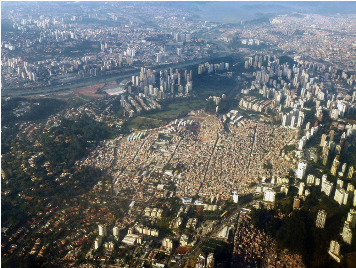
Photo 2 Paraisópolis