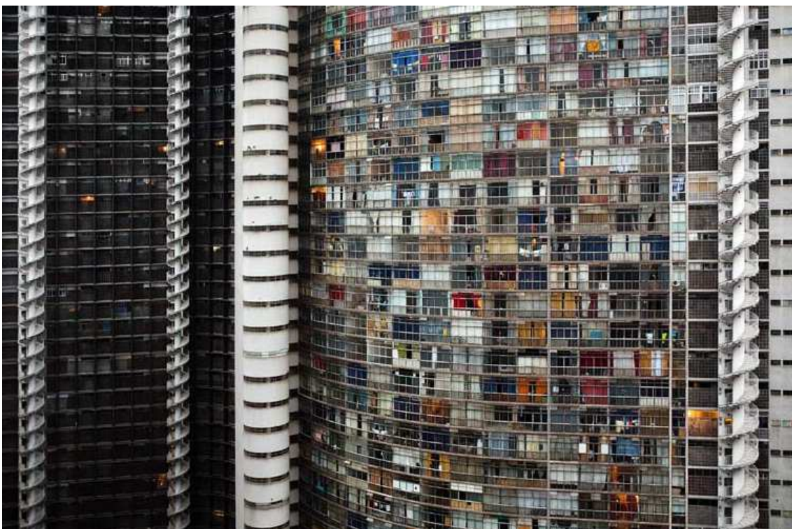
Photo 7 Building in São Paulo's center