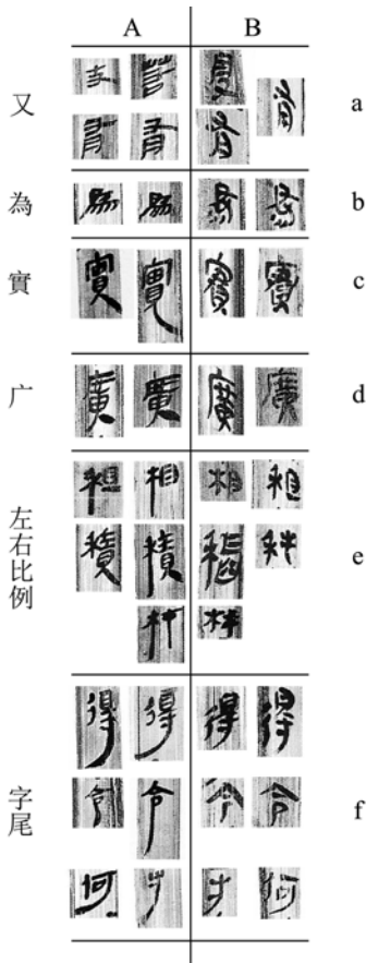
Fig. 2 Suan shu shu A–B ‘fingerprint’ chains. Criteria: (a) 又 component, angle, square vs. round; (b) 為; (c) 實, final stroke and composition (卣 vs. 尹); (d) 廣, “feet” and component symmetry; (e) 木·禾 left–right component symmetry; (f) exaggerated end-stroke.

better yet, said script, one can calculate the odds of concurrency down to impossible levels.