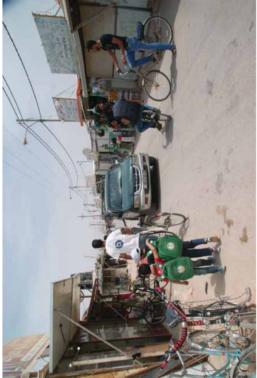
1. Zaatari. The main street of the camp, called Shari, in 2017 (P. Piraud-Fournet 2017). مخيم الزعتري، الشارع الرئيسي الذي يبيع شارع السوق في 2017 (ب. بيرة - فورنييه 2017)

one of these tents - almost 6m long and 4m wide, 24 m 2 . At that time, the kitchens and the sanitary blocks (showers, toilets, laundry) were collective and built in concrete. Because of the lack of space inside the tents, families used to spend a significant part of their daily life in the only space available, the streets; the tent was used for eating meals, as a bedroom and a madhafeh . A few months later, refugees began to transform their tents by themselves, adding a wood-