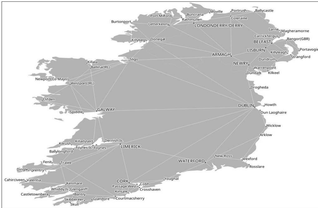
Figure 2. Irish road graph issued from automated model and manual modifications.