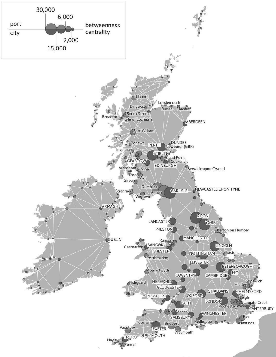
Figure 3. Road centrality of UK and Irish ports.