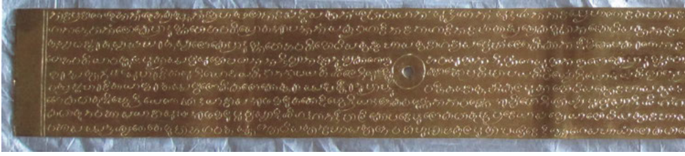
Fig. 2: Leaf of gold manuscript of the Pañcaviṃśatisāhasrikā Prajñāpāramitāsūtra , from Anurādhapura, Sri Lanka, ninth century. Colombo National Museum. Approximately 63 × 6 cm.

writings, although later than copper plates, are the lavish manuscripts of scriptures, like, for instance, tin manuscripts from Burma, or, possibly, the ninth-century gold manuscript of the Pañcaviṃśatisāhasrikā Prajñāpāramitāsūtra from Anurādhapura in Sri Lanka (Fig. 2). 15 As the central visible elements of a cult of the book, such manuscripts, like their lavish palm-leaf counterparts, can be exhibited, displayed and honoured, but are not meant to be read either. 16 We will see that copper-plate grants are sometimes buried too and that they are not meant in the first place to be read except when received by their owners or in case of legal disputes.