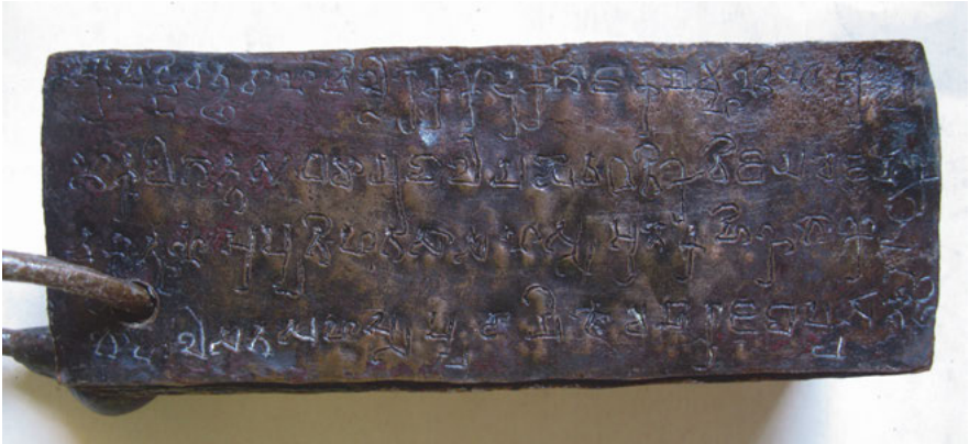
Fig. 3: Hiraḥaḍagaḷḷi plates (IR 3), verso of plate 2, found in Karnataka, South India, middle of fourth century. Chennai Government Museum. Approximately 20,5 × 9,5 cm.