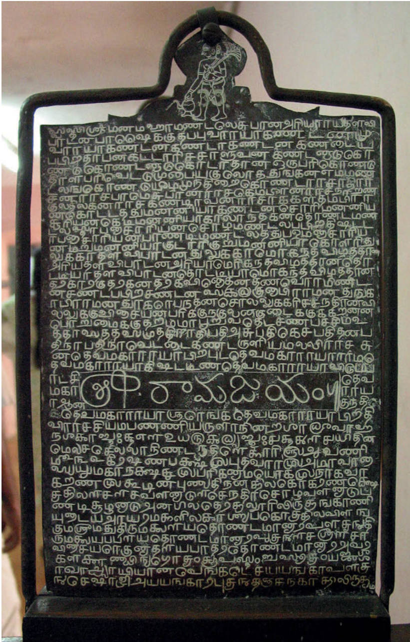
Fig. 7: Toṅṭaimān Raghunātha’s grant, recto plate, Tamil Nadu, South India, 1803 CE. Pudukkottai Museum (copper plate no. 30). Approximately 27 × 19 cm.