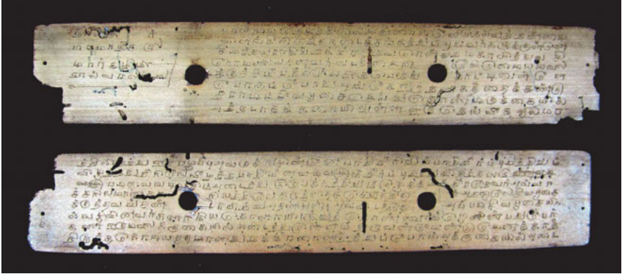
Fig. 8: Folios 1v and 2r of a manuscript copy of a mid-nineteenth-century printed edition of the Tirumurukāṛruppaṭai , Tamil Nadu, nineteenth or twentieth century. Annamalai University Library (cat. no. 97; Acc. no. 340049 [old] and 860 [new]). Approximately 19 × 3,5 cm.