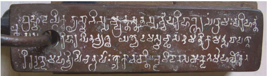
Fig. 4: Pikira grant (IR 16), verso of plate 4, undivided Andhra Pradesh, South India, middle of fifth century. Chennai Government Museum. Approximately 18 × 4,5 cm.