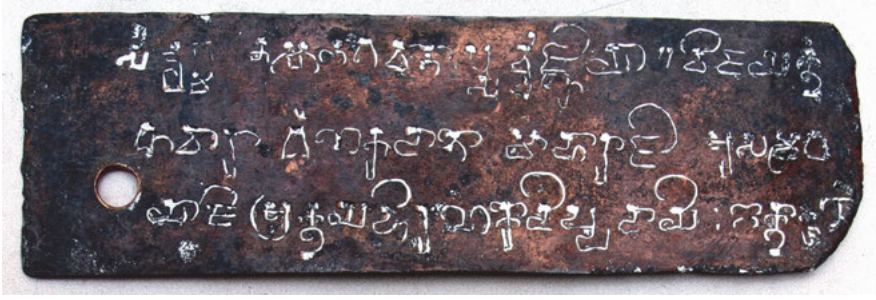
Fig. 1: Pātagaṇḍigūḍem plates, verso of plate 1, undivided Andhra Pradesh, South India, third century. Telangana State Museum, Hyderabad. Approximately 22,5 × 7 cm.

very common practice in ancient India: the engraving of royal grant orders on copper plates, which are given to the recipients as title-deeds. Such copper-plate grants have been produced in India by the hundreds, as evinced by the extant specimens, and probably by the thousands, from the third century CE onwards. 4 The two volumes of Dynastic List of Copper Plate Inscriptions Noticed in Annual Reports on Indian Epigraphy published by the Archaeological Survey of India comprise respectively 1637 and 413 items, i.e. a little more than 2,000, a total which however includes records, other than grants, also inscribed on copper plates. 5