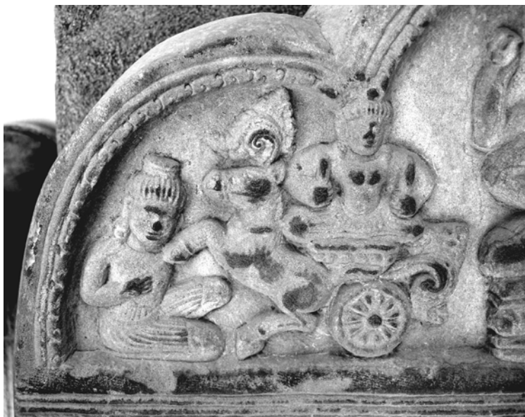
Plate 47.2: Detail of Plate 47.1, top of side A, left: Sūrya.