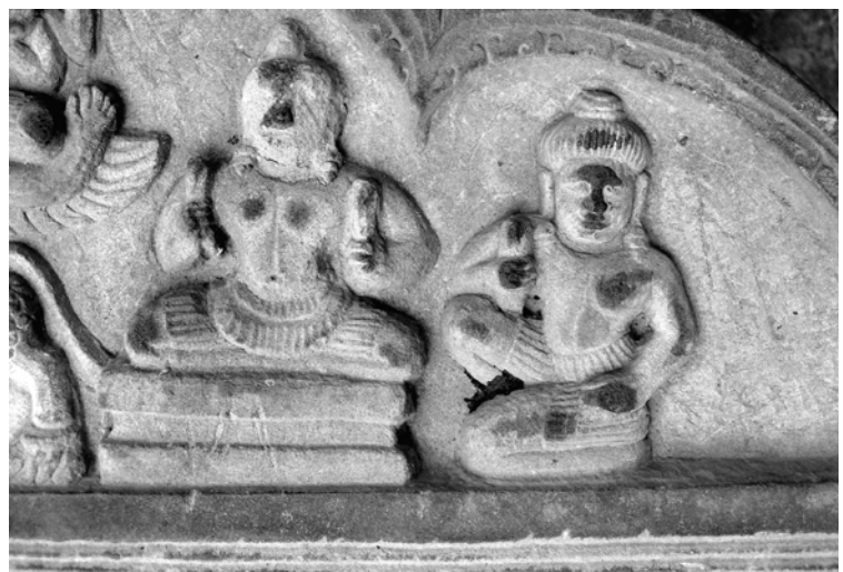
Plate 47.3: Detail of Plate 47.1, top of side A, right: Candra.