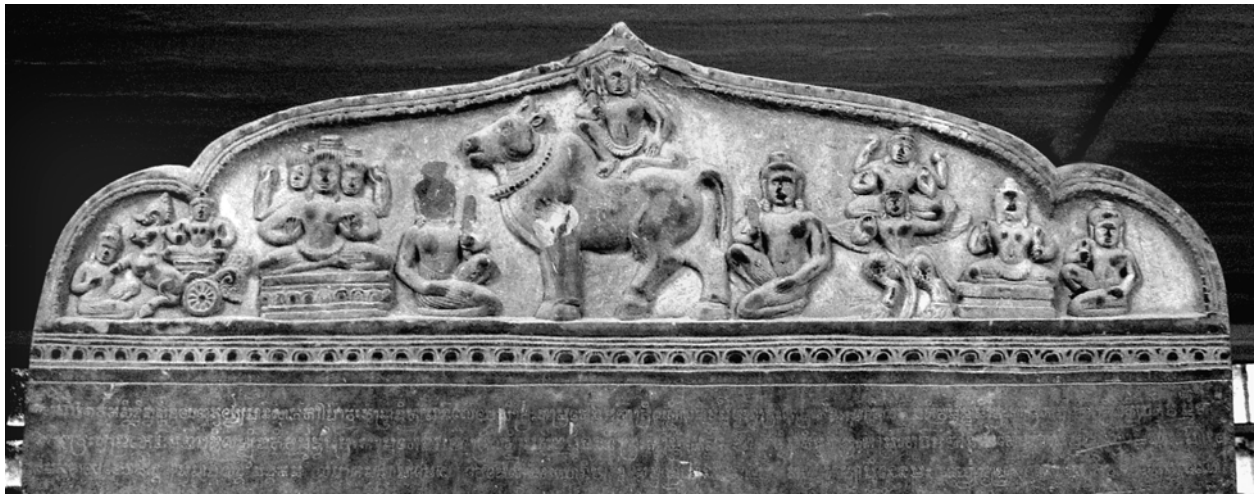
Plate 47.1: Detail of the inscribed Khmer stela K. 1198, c. 1014 CE, top of side A.