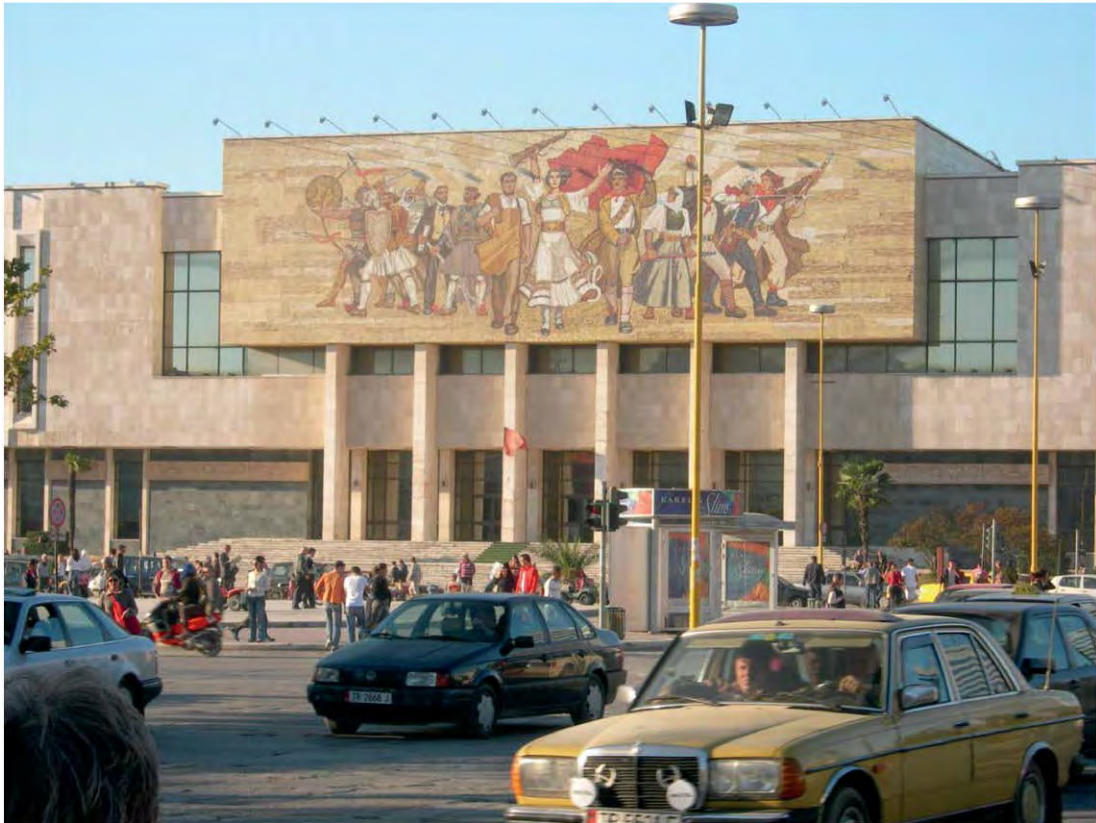
Figure 30.2. “The Albanians” mosaic at the entrance to the National Historical Museum in Tirana tells a story of resistance to invasion and occupation throughout the country’s history. Such presentations of the past are among the material ways history incurs upon everyday life, often to political and religious ends, 2006.

believed that foreign financial donations support Islamic proselytism in Albania. In particular, Turkish funding from the Gulen philanthropic agencies has been very instrumental in building religious and educational institutions. It is believed by many that they also provide individual pensions for new converts to Islam. 51 Curiously, during a short visit in Albania in the summer of 2015, I could barely notice any women covered with a headscarf in Tirana. There might be many reasons for the observable decline in the display of headscarves, one being that if there is no longer funding provided to support Muslims in Albania, there is no longer reason for some to display Muslim belonging, which the scarf is seen to index. 52