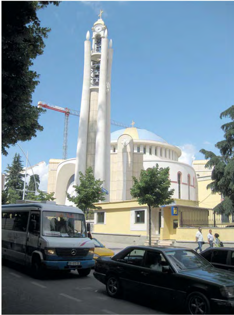
Figure 30.1. The Resurrection Cathedral in Tirana, as construction nears completion, 2013.

by attesting to the archbishop's theological credentials, 18 but the issue was less about religion than it was about language. To some, the archbishop opting to celebrate Easter in Greek is seen as part and parcel of the Greek Orthodox Church's dismissiveness of the Albanian language and identity. This is well understood especially in the context of the everyday exchanges of Albanian immigrants in Greece, who have adopted Greek language and converted to Greek Orthodoxy. These acts obviously aid integration into Greek society, but if Orthodox Albanians are acquiring more and more Greek at the expense of their native language, something political is at stake.