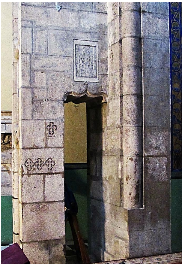
Fig. 24. Lviv. Cathedral. Interior. North-east pillar, south face.