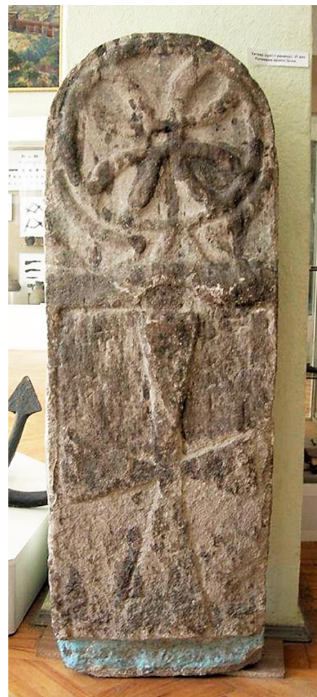
Fig. 16. Nor-Nakhichevan (Rostov-on-Don, South Russia). Stela with two crosses.