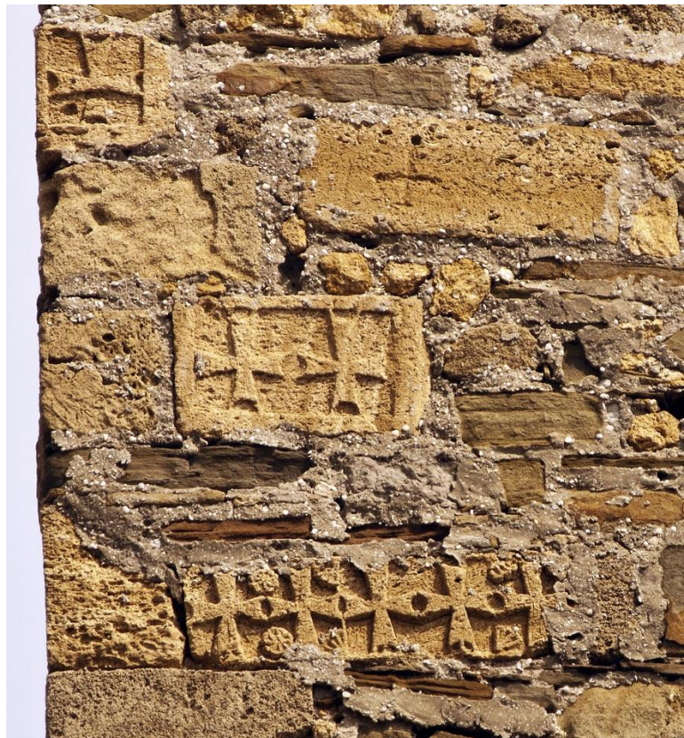
Fig. 18. Sudak. Tower of Federico Astaguera. South façade.