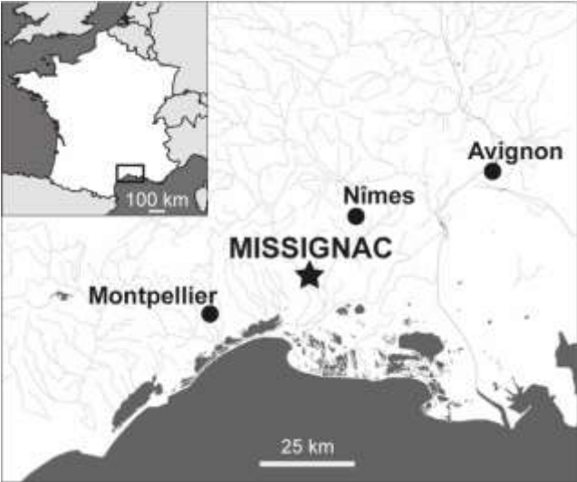
Fig. 1 Location of the site