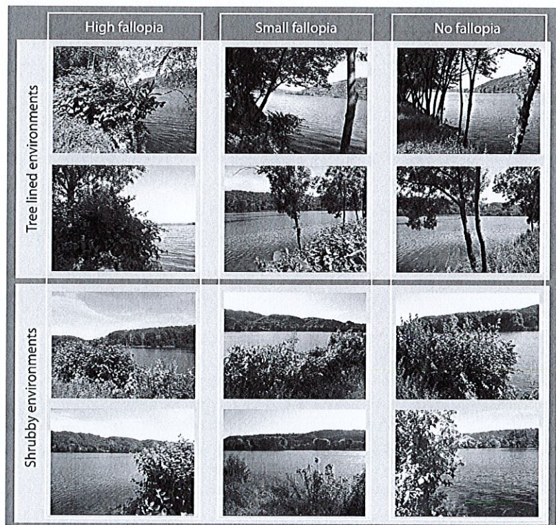
Fig. 1 Photographs used for the photoquestionnaire. Photographs were taken along the Rhône River; any anthropic elements were removed

distributed between the five age categories that composed each sample ( \chi^2(9) = 3.95 , NS).