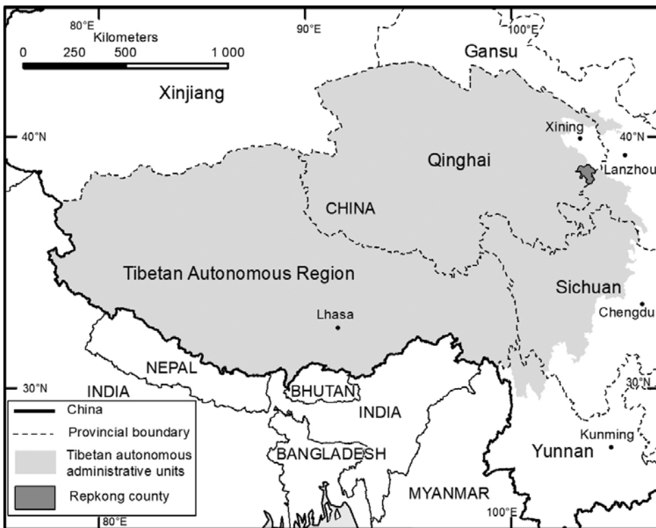
Figure 1: Repkong county in northeast Tibet (Amdo)

The Repkong [Reb kong] county in far northeast Tibet (see fig. 1) stands out as probably the area with the highest density and largest number of tantrists—something on the order of 2,000 tantrists for approximately 80,000 ethnic Tibetans. They thus comprise more than 5 percent of adult men, a figure that is comparable to the proportion of monks in a Tibetan society already