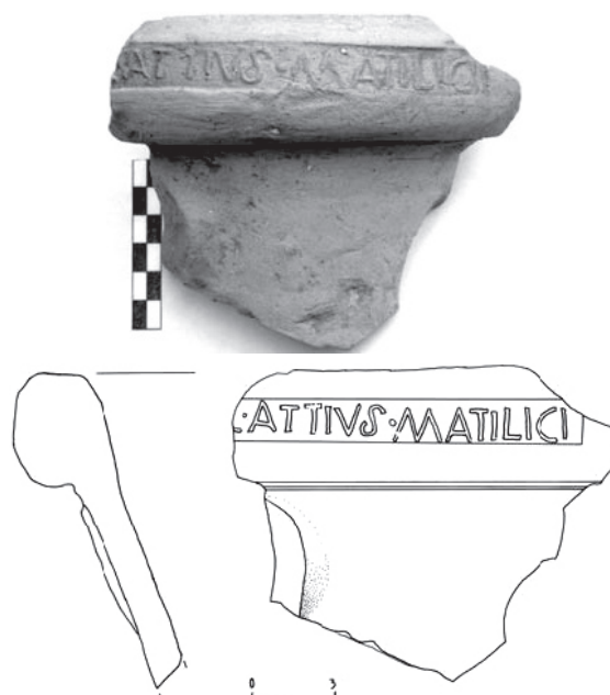
Figure 3. Lamboglia 2 amphora from Matelica (Macerata) (Paci 2016: 541, figs 1-2).

Lamboglia 2 production (Ventura and Capelli 2017), while a revision of the materials from Torre delle Oche at Maranello (Modena) has confirmed the production of a shape transitional from late Greco-Italic to Lamboglia 2 (Corti 2017). For the latter type, whose stamps are usually not very revealing, a significant novelty is that of a rim fragment with the name C. Attius and with the indication Matilici(s) , which has been interpreted as indicating its origin from Matelica (Pescara), an area renowned for wine production (Paci 2016) (Figure 3).