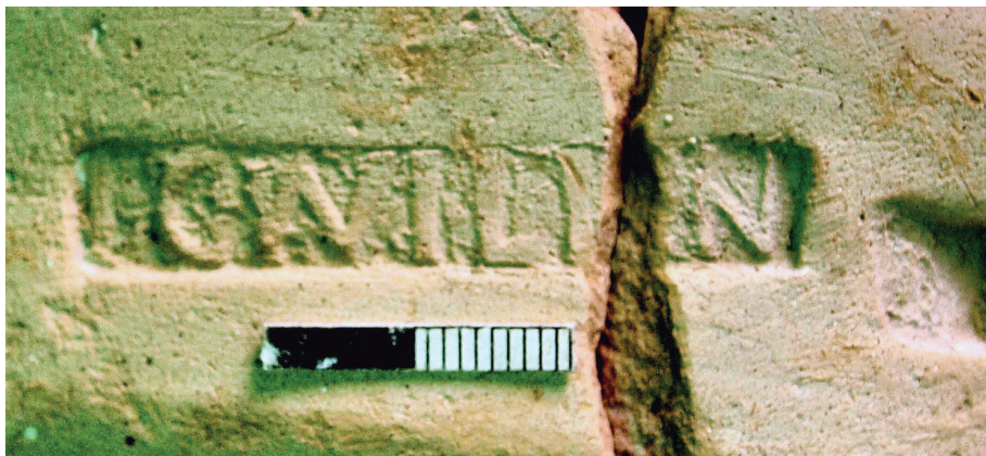
Figure 4. Stamp of the freedman L. Gavius Licinus (Curina, Mongardi 2018: 283).