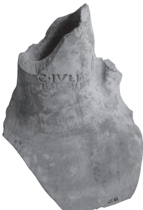
Figure 2. Funnel-shaped rim amphora stamped C.IVLI/MARCELLI (Gaddi and Maggi 2017: 312, fig. 88).

distribution, chronology (from beginning/mid 1st century to mid 3rd century AD) and area of origin (mid-Adriatic area, Cisalpine, Picenum ), we now have a very complete picture (Mazzocchin 2009). They are common within the Canale Anfora materials (Gaddi and Maggi 2017: 308-313), where one example obliged us to rethink the problem of their contents: an amphora stamped C.IVLI MARCELLI, which is the only one with funnel-shaped rim from this context to bare traces of resin on the inner surfaces. As the same stamp appears on flat-bottomed wine amphorae, this evidence might support the possibility that within the same workshops different shapes were manufactured for different kinds of wine, or that a shape usually used for oil had been used for wine (for the stamp see Cipriano and Mazzocchin 2016: 218-220) (Figure 2).