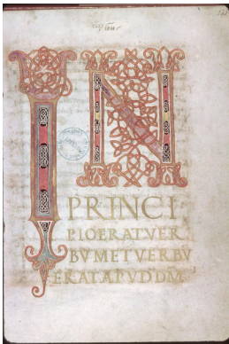
Fig. 15: Épernay, BM, ms. 1, fol. 135.

The properties of medieval writing, its depth and transcendence on the one hand, its real presence in the world on the other, allow letters to obtaining meaningful material qualities: size, color, position, ornamental features... Letters thus become objects, sometimes works of art by themselves, as it is the case for example in the first page of John's gospel in Carolingian precious books, where the opening letters of the prologue ( In principio erat Verbum ) have been installed as monumental shapes within the parchment (fig. 15). Writing creates forms, symbols, and images of letters. Medieval art is, on this aspect, the source of the recurring practice of works of art made of letters (mostly painting and sculpture), as one can still appreciate in contemporary art