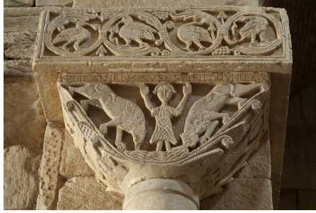
Fig. 6: San Pedro de la Nave, church. Capital of Daniel in the lion's den

de la Nave church, the inscription transforms the single image of Daniel praying for his salvation into a representation of the entire biblical narrative (fig. 6) 16 . 3) The encounter text/image reveals what is contained in the image but escapes the means of figuration, such as voices, sounds, sensations, feelings. On the 12 th century capital figuring the Annunciation to the shepherds in the canon church of Chauvigny, the inscription stages on stone the angel's voice and makes it resonate in the image (fig. 7) 17 . 4) It allows, thanks to the poetic elaboration, to transform what is shaped in what has to be seen, to go beyond the