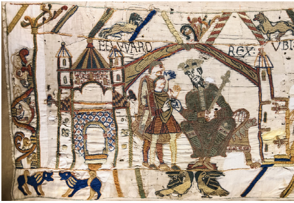
Fig. 5: Bayeux tapestry. King Edward in his palace

In order to schematize what bimodality brings into medieval art, one can establish four main purposes and effects of the encounter between texts and images 14 . 1) By naming an image and by distinguishing it from another image, it allows the institution of this very image as a representation. In Bayeux tapestry for example, the name EDWARD REX makes the image of a king exist as a representation of King Edward (fig. 5) 15 . Most of the short inscriptions, mainly names, written as close as possible to what they designate, correspond to this first purpose. 2)