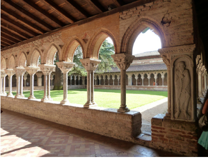
Fig. 12: Moissac, Saint-Pierre abbey. Cloister

The cloister of the Saint Peter abbey in Moissac is a major monument in the history of medieval forms (fig. 12). It is at the same time the largest and best-preserved Romanesque cloister in France, making it a centerpiece at the scale of the medieval West. The sculpted elements in place today (columns,