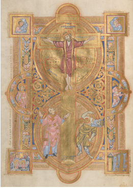
Fig. 2: Munich, Stadtbibliothek. Uta Codex (ms. clm. 13601), fol. 3v