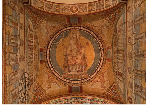
Fig. 3: Prüfening, Abbey Church. Wall painting of the Ecclesia

image in the abbey church of Prüfening (fig. 3) 12 , it becomes easy to realize that writing does not make anything more obvious or simpler. On the contrary, it seeks to transform the discourse of visuality by densifying it: the Crucifixion is described in all its theological and spiritual implications in the manuscript, and the Church is described as Christ's spouse, empress of the world in Prüfening. Bimediality does no longer superimpose two types of signs but it totally blends them into a new, single visual object. The artists used for this purpose devices allowing the conjunction either by intermingling signs, as in the case of Bordeaux lion, framing the image, in Prüfening for example, or using objects on the image as support of writing, as one can see the books and phylacteries sculpted on the façade of Notre-Dame-la-Grande canon church in Poitiers at the end of the 11 th century (fig. 4) 13 .