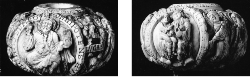
Fig.10-11: Lyon, Museum of Fine Arts. Ivory node of a liturgical staff

and bottom, this circular piece was located in the upper part of a baculus , the bishop or abbey staff, just below the curved part. The ivory knot is carved with many figures (archangels, evangelists) between two circular medallions carried by angels, presenting Christ in majesty in the first one, and the Virgin and Child in the second. Around the upper edge, one can read the names Matheus, Johannes, Michael, Uriel, Gabriel and Raphael . These names make the figures exist as images of the evangelists and archangels, following the first purpose of the medieval encounter between text and image. The verse Omnipotens humile benedic hoc semper ovile (“O Almighty one, bless forever this humble herd”) is engraved around Christ in majesty; around the Virgin and Child: Stella parens solis cultores dirige prolis (“Thy, Star who engenders the Sun, guide those who worship your child”); on the phylacteries connecting the circles: Marcus and Lucas .