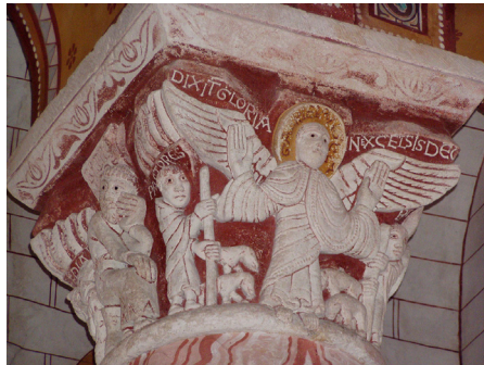
Fig. 7: Chauvigny, canon church. Capital of the Annunciation to the shepherds

form towards an increased and complex meaning. The verse inscribed on top of the image of the Virgin and Child in the façade of Saint-Aventin church invites the viewer to contemplate the entire mystery of incarnation beyond the sculpture of a mother and her son (fig. 8) 18 .