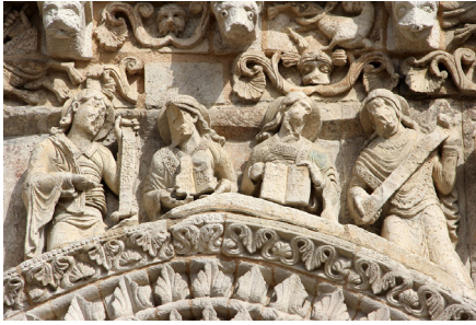
Fig. 4: Poitiers, Notre-Dame-la-Grande, façade. Prophets holding books and philacteries