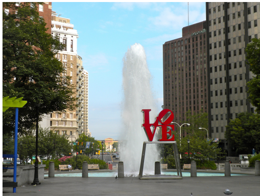
Fig. 16: Robert Indiana (1928–2018), Love Park (Philadelphia).