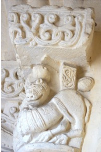
Fig. 1: Bordeaux, Saint-Seurin, church. Capitals of the lions

as a simple redundancy of the sculpture that would keep figuring a lion even if there were no inscription. Because many medieval inscriptions in painted or sculpted images are names or very short texts, as in Bordeaux, the main historiographical trend establishes the image as an illustration of the text, and the inscription as an identification of the image. Everything happens as if bimodality was only intended to clarify one of the sets, as if the image or the text could not signify, evoke, convince, or share by itself. The simplicity of most of the inscriptions painted or engraved in the image could perhaps give the impression that writing is anecdotal or superfluous, and that it is used to solve a limit of the image rather than to produce a visual object, rich in its display and complex in its meaning.