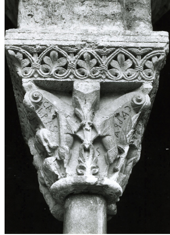
Fig. 13 : Moissac, Saint-Pierre abbey, cloister. Capital of the Annunciation to the shepherds

On the west, south and east sides, an angel is announcing Jesus's birth to a group of shepherds surrounded by their herds of oxen and goats (fig. 13). The visual presence of nature at the background of the scene, is reinforced by the alphabetic signs sown in-between the figures. With no apparent order, letters are inserted between the legs of the animals and the trunk of the trees; engraved directly on the background without any particular device, they seem to occupy the available space near the figure they give the identification. Some letters are drawn