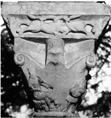
Fig. 14: Moissac, Saint-Pierre abbey, cloister. Capital of King David and his musicians

This is also the case for the capital representing David and the sacred musician 30 . On three sides, the name of the musician and of his instrument has been written in a complex arrangement which can recall that of the boustrophedon. The arrangement of the letters could stand out in the representation of what the sculpture does not show, namely the musical sound emanating from the instruments and the harmonic relations thus established between the four characters all around the basket. Letters would show a perfect order and would be a creative resource to visually displays what can only be heard. On the south face (fig. 14), David is accompanied by the inscription: David citaram percuciebat in domum Domini (“David was paying the cithara in God’s house”). This narrative inscription is not placed here on the abacus, like most of the narrative inscriptions in Moissac, but on the background of the image. This can be explained by the ability of writing to institute the figure in the raw material of the capital and to transform the stone in an image of the Domus Domini evoked in the Psalms. Unlike many capitals in the cloister of Moissac,