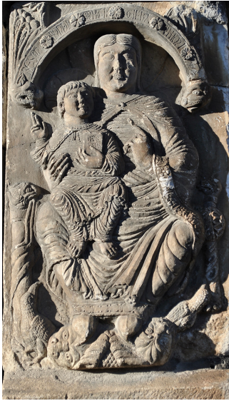
Fig. 8: Saint-Aventin, church, façade. Sculpture of the Virgin and Child

This overview is of course caricatural because of the uniqueness of each of the encounters between texts and images - this uniqueness being one of the main features of medieval documentation. The conjunction of writing and image is everywhere in medieval art, but it is neither mandatory nor systematic. It always belongs to the artist's or patron's choice who decides to combine alphabetic and iconic signs to produce a complex and unique visual paradigm. Any attempt to find models or structures is therefore futile. It is actually more important to look at medieval bimodality as an imprint of the artistic creation itself.