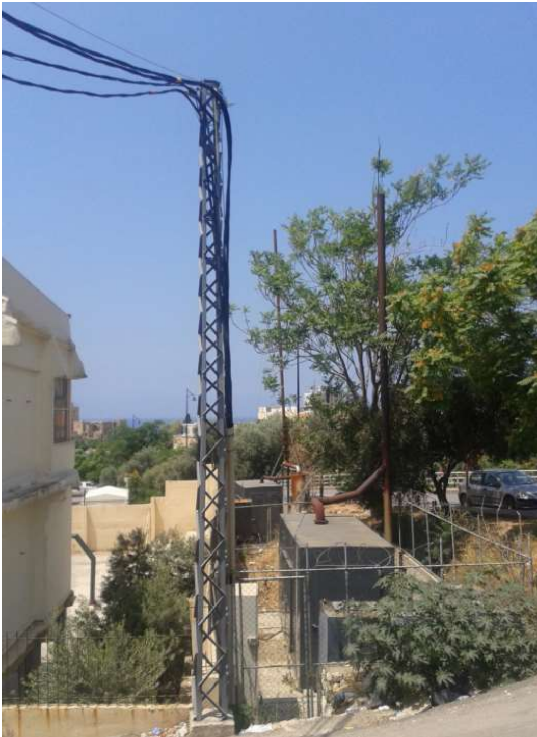
Figure 17.3 A fenced generating unit belonging to EDJ, and a pole in the grid managed by the same company.