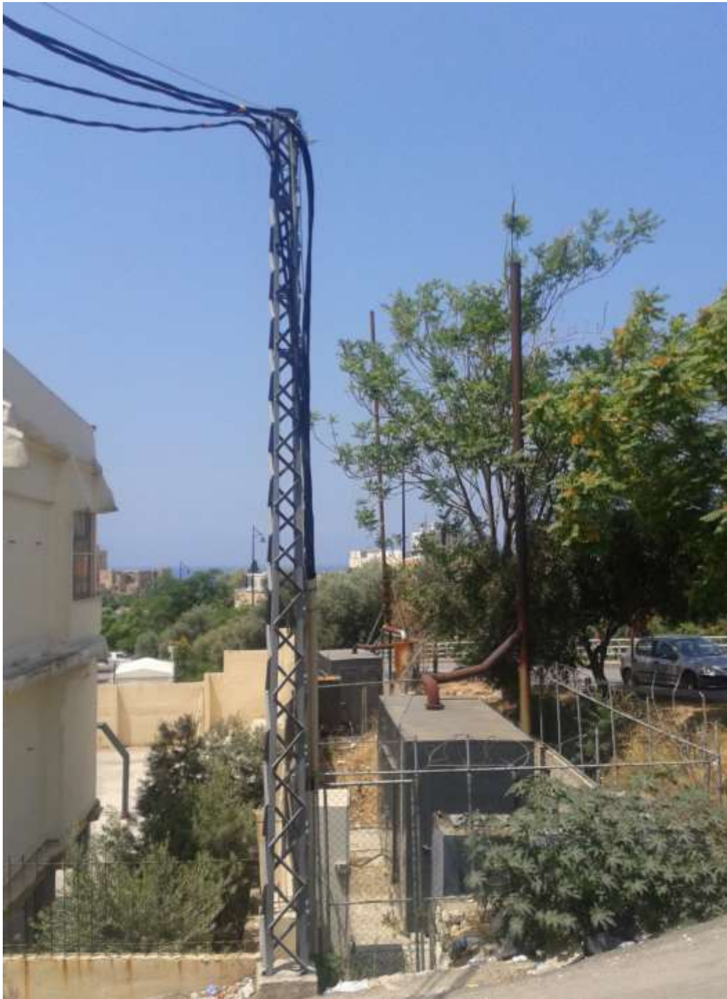
Figure 17.3 A fenced generating unit belonging to EDJ, and a pole in the grid managed by the same company.