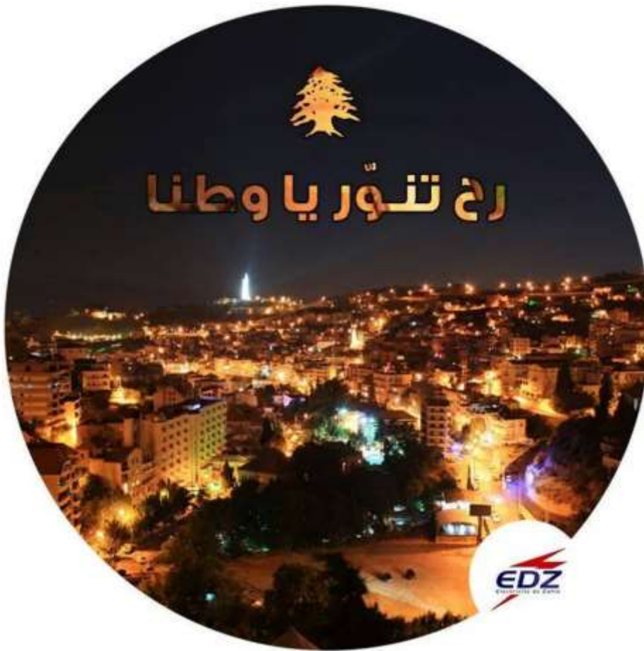
Figure 17.4 EDZ advertising its ability to light up the country.