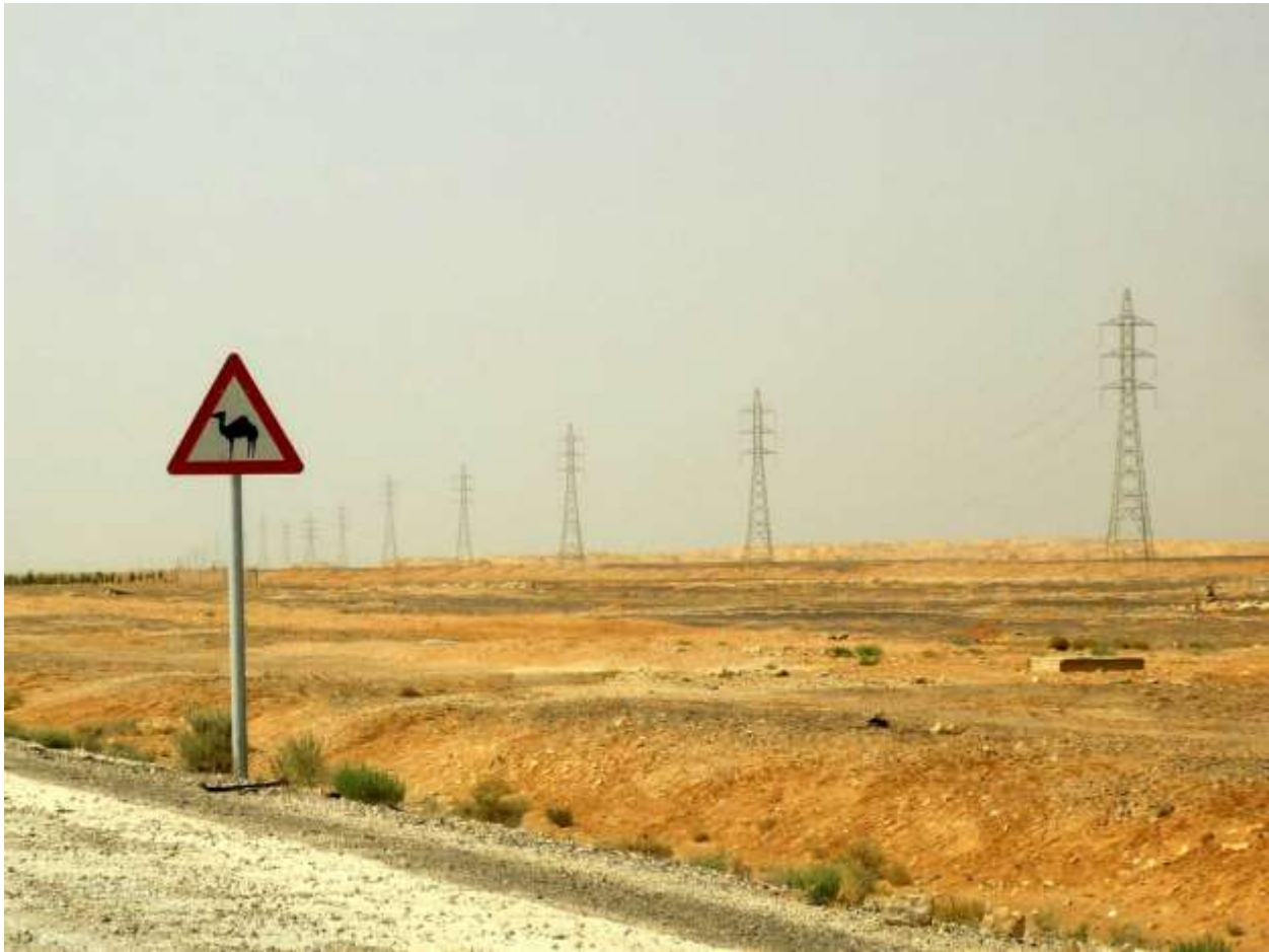
Figure 17.2 The high-voltage electricity line in the desert between Amman and Aqaba. Building a nuclear power plant near the sea would have implied the doubling of this line over some 400 kilometres, a huge investment.