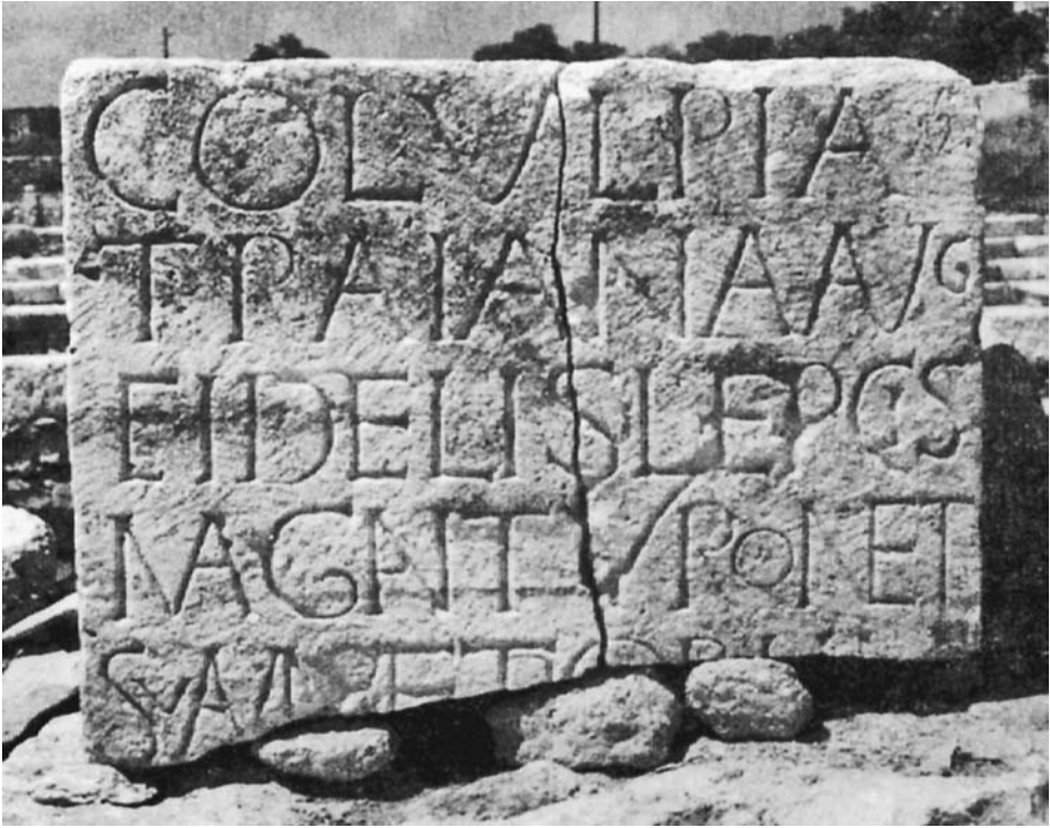
FIGURE 9.1 Latin section of a bilingual dedication found in Tyre: It commemorates how the Roman colony of Lepcis Magna pays homage to Tyre, its metropolis, by erecting a statue in the image of this city, ca. 194–198 CE.