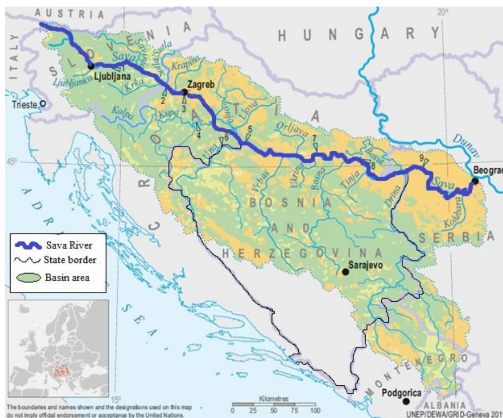
Figure 1. Sava River basin and its area on the territory of Bosnia and Herzegovina

Other than being main agricultural area for the country, the Sava River basin also represents an important source of water for settlements (the biggest regional centers directly or indirectly depend on Sava River or one of its tributaries), industry, energy and all the ecosystems. Due to all the reasons mentioned, Sava River basin is an integral part of the development and support for each and every of the sectors mentioned, and thus, a valuable target for a nexus assessment.