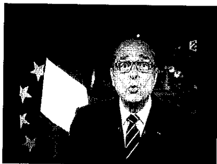
Chirac addresses the nation in response to the 2005 riots in France.

The 2002 election was a watershed for France in a number of ways. The outgoing prime minister, Lionel Jospin, was expected to make it into the second round, but was led by Jean-Marie Le Pen of the far-right National Front party, 16.9% to 16.2%. In the second round, Chirac won easily against Le Pen, 82.2% to 17.8%.