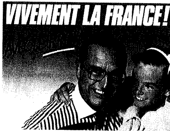
Campaign poster for Jacques Chirac's RPR party in 1986.

including lowering income taxes, improving road safety and measures to help the disabled. However, on the international stage his administration was most clearly distinguished by its anti-American