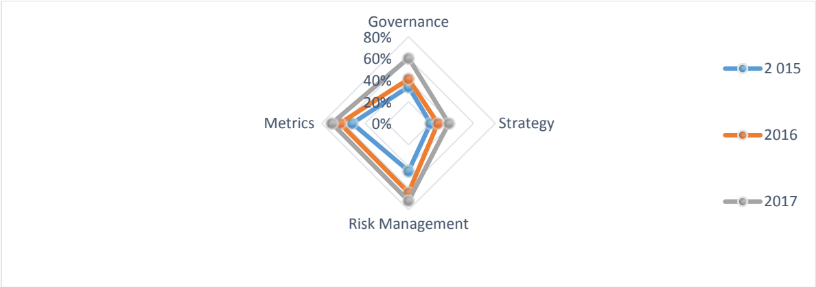
Figure 4 : CCI according to the four TCFD areas

In 2017, CAC 40 companies communicated the most in the areas of risk management (71%), metrics (70%) and governance (60%), far ahead of strategy (37%), and there was an improvement in the environmental disclosure in each area (see figure 4).