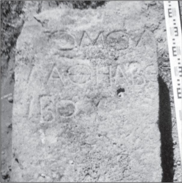
2. Epitaph of Gomollathe, Daughter of Abeibos.