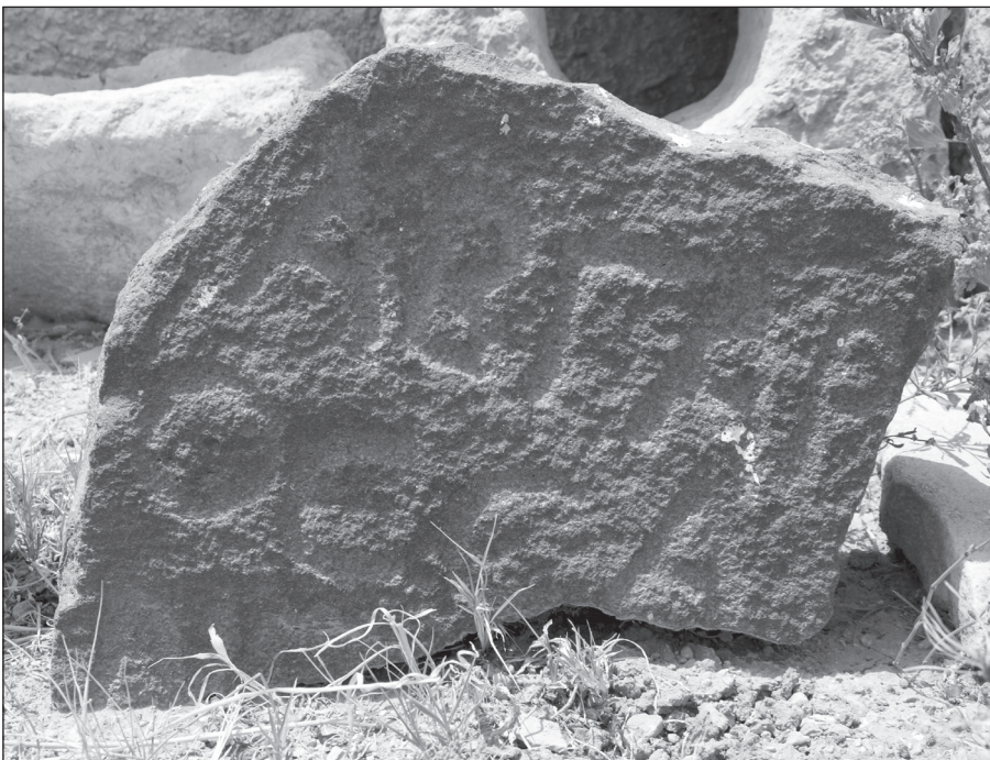
1. Epitaph of Abgaros.

Onomastic parallels: I. Jordanie 5.1, 628 (Αβιβος), 707 (Αβειβος); 6 (Γομολλαθη), 265-269 (Γομολαθη).