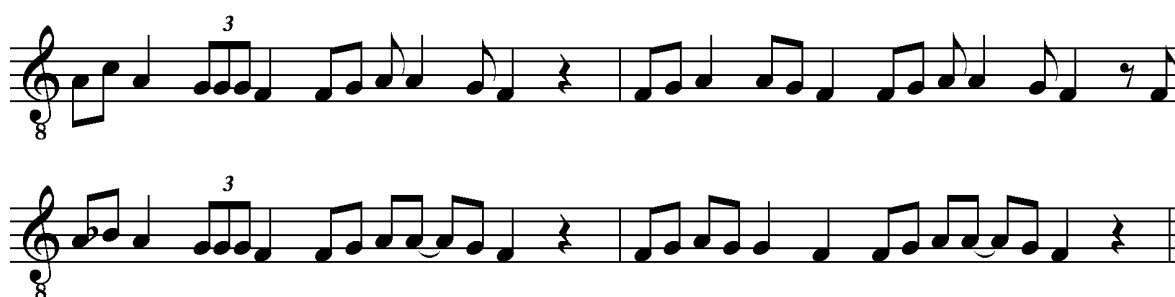
Figure 3: “Longo”, Canoe-Song. Archiv Kamerun 37, 1909 (Transcription S. Fűrnis)

One song was recorded by Zenker in Cameroon, but also by Hornbostel in Berlin viii . It is the paddlers' song, called Longo by Zenker.