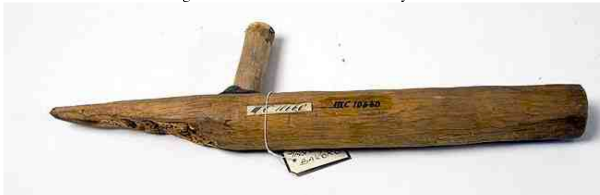
Figure 2: Mirliton from the Zenker-collection, Inv. N. III C 10660, Berlin, SMPK, Ethnologisches Museum.

Ethnological Museum iv . On the other hand, some said that the Ngi was not supposed to sing and that item 6 is an invocation of the spirit. The notes in the Archive, however, seem to indicate the contrary. Zenker's collection of ethnographical objects also contains some mirlitons. A list in the Museum's archive indicates that one of them v was played during a Ngi-ceremony: "Instrument used for the Ngi dance (sounds like a comb and tissue, is used in the same way)". Either the historical gap between the recordings and my interlocutors is too great to be bridged, or the ritual secrets are still protected when talking to a foreign uninitiated white female ethnomusicologist. This seems to be a limit to any actual fieldwork.