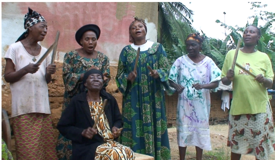
Figure 4: The women of Kouambo reconstitute a bride's ceremony for the ethnomusicologist. (Video S. Fürniss 2012).

Cylinder 3 is accompanied by the following text: