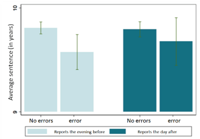
Figure 2 – Effect of news reports about miscarriages of justice on prison sentences

Note: The columns indicate the average sentence handed down according to the content of the evening news the day before (first two columns) and the day after (columns 3 and 4). Bars 1 and 2 have confidence intervals of 95 per cent. For example, the average sentence pronounced the day after evening news stories about court errors (column 2) is 9.58 years (9 years and 210 days), with a 95 per cent chance of being between 9.41 years and 9.74 years (the confidence interval). The average sentences following the reporting of court error stories the day before have a confidence interval that does not overlap, which means that their difference is statistically significant (which is not the case for average sentences that are followed by miscarriage of justice stories the day after)