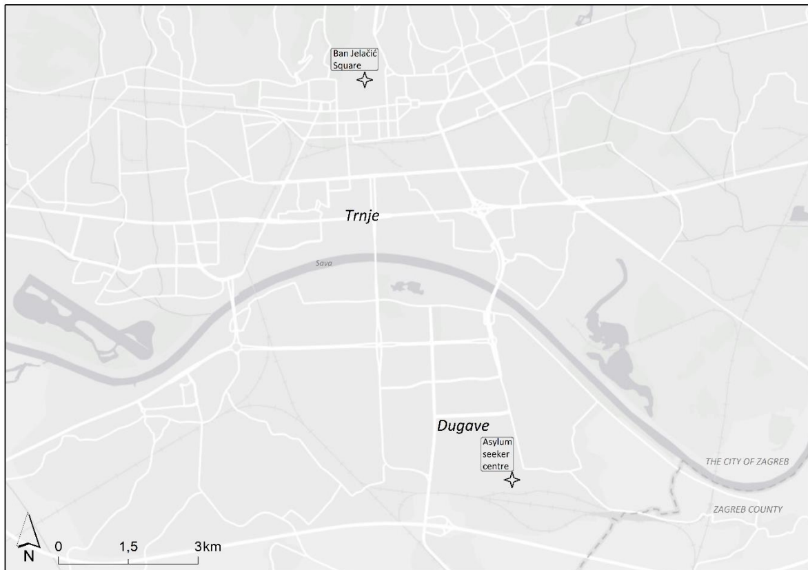
Figure 1. Locations of Dugave and Trnje neighbourhoods in relation to Zagreb's centre (Ban Jelačić Square) 4

The theoretical framework of this paper is grounded on the plethora of discussions related to asylum seeker issues and general attitudes on immigration in scholarly literature. Apart from considering the way asylum seekers are depicted and the influence of socio-demographic characteristics on attitude formation, we focused special attention on contact theory, as well as theories related to group threat (conflict) hypothesis. Along with confronting the contact and conflict approach, the focus of the research is set on a location/neighbourhood framework. Finally, as stated by van Kempen and Wissink (2014), focusing the research on the residential location alone would be too narrow, given the spatial mobility of people, as well as communication technologies. In relation to this, we also pay special attention to the influence of media. Following the theoretical framework, the general and cross-sectional Croatian context is described, providing the relevant information for the understanding the obtained results. The description of the research sample and methodology will be followed by the presentation and discussion of definitions of asylum seekers given by respondents, their first source of information on the subject of asylum, attitudes towards asylum seekers based on the dimensions of social contact, economy/health, ethnocultural similarity, asylum seeker credibility estimation, as well as attitudes based on locational attributes of asylum seeker reception.