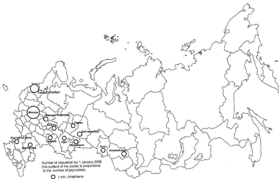
Figure 1. The largest cities of Russia.