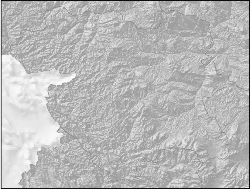
Figure 1: Background map for Kordestan Province (Map design: Robert Oikle, GCRC. Source: http://iranatlas.net )

Secondly, we brought together settlement-related geographic data (NCC 2016, Roostanet 2016) and open-access demographic data for all populated places of Kordestan from the 2011 census of Iran (ISC 2011), which was the most recent available census data at the time of research. However, because the geographic data has not been made publicly available in tabular format, members of the research team spent several hundred hours reconstructing georeferenced (GPS) coordinates for each settlement.