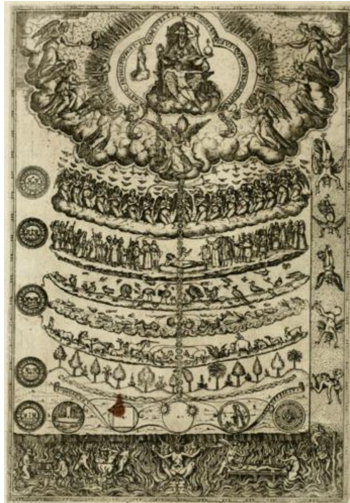
Dessin de la scala naturæ par Didacus Valades, Rhetorica Christiana (1579). Didacus Valades (Diego Valades) — Rhetorica Christiana, It is taken from Retorica Christiana, published by Diego Valdes (signed as F. Didacus in the bottom left) in 1579.