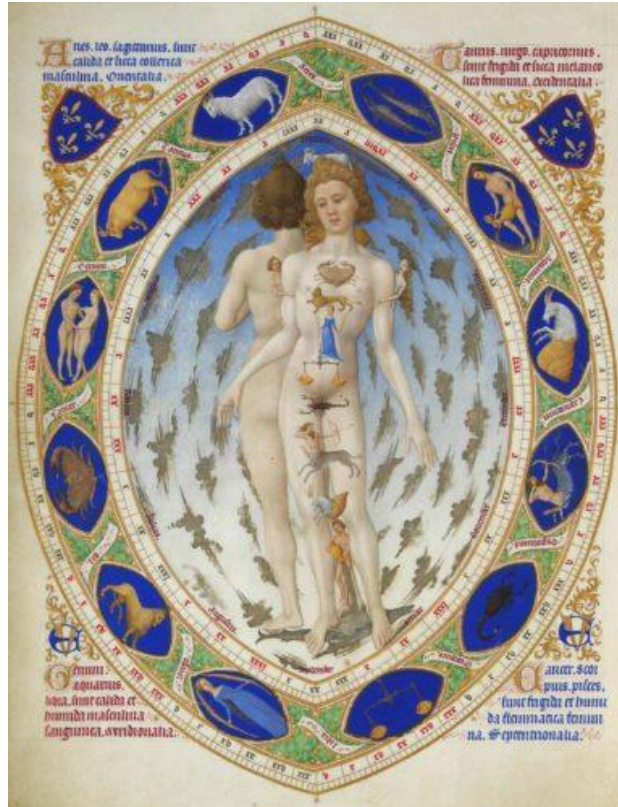
©Photo. R.M.N. / R.-G. Ojž da – The anatomical-astrological human – Limbourg brothers – public domain, wikipedia

To see more about the harmonious world thought and intellectualized by Renaissance practitioners, physicians, mathematicians, astrologers or naturalists you can read this website « Botanical Mind ». It provides information on the “intrinsic connection between geometry, music and the earthly and astral realms” 3 .