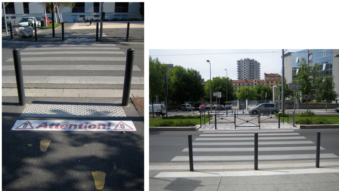
Fig. 2 & 3 - Two examples of ‘bateaux’ and hazard warning strips at pedestrian crossings

Directional strips were marked by hollowed out or raised grooves or elastomer adhesive tape. They provided directional guidance for the sight-impaired, who could keep track of them with a stick, moving from A to B (Fig. 4 & 5). Since 2014, they must comply with the NF P98-352.