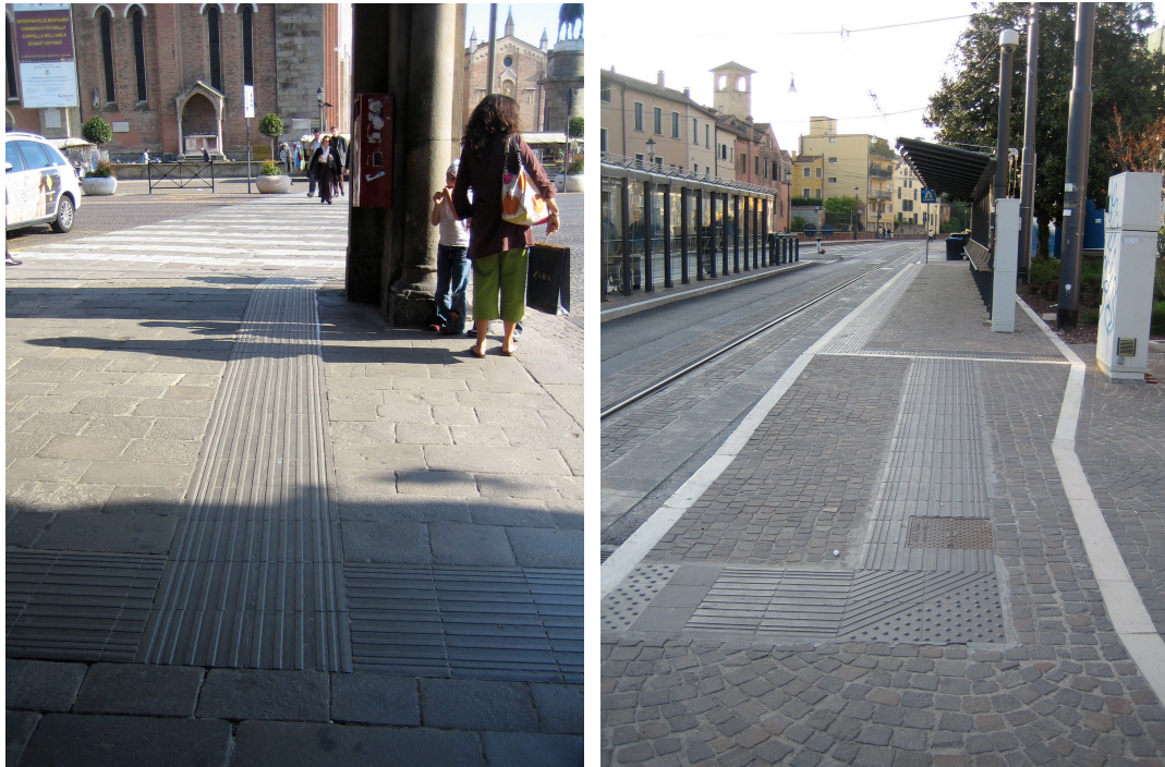
Fig. 4 & 5 - Directional strips before pedestrian crossings / Directional strips and hazard warning strips on a platform of tram

At road crossings, these devices were generally supplemented by audible signals coinciding with pedestrian lights: a loudspeaker or transmitter informed pedestrians that they could step out onto the pedestrian crossing and get across safely. For example the EO guidance system, designed by the French society 'Études et Développement de Produits et Services', operates as follows: a microchip receiver is built into pedestrian cues; sight-impaired pedestrians carry a remote-control which can trigger the receiver. Once activated the system produces two types of sound message: the name of the street being crossed and the colour of the pedestrian light.