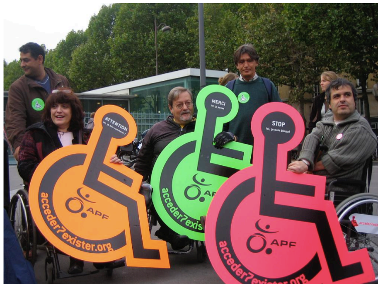
Fig. 1 - In 2008 in Paris, the Association des Paralysés de France is launching the 2nd edition of its 'Access to Exist' awareness campaign, one of the objectives of which is to denounce architectural barriers to the movement of people with disabilities. The principle of action is simple: implant life-size silhouettes whose color says the accessibility of the places. Green for easy access, orange for obstacle access, red for inaccessibility without external help.

Thinking on the accessibility of public urban space, and the adoption of a regulatory framework, was instigated in France in the 1970s by social unrest, in particular the revolt of the motor-disabled against architectural barriers to their movement. Such obstacles were numerous: raised platforms or steps at the entrance to many public buildings; steeply sloping or tilting streets; profusion of street furniture, often badly placed; pavements too high to be mounted by wheelchairs; and so on. The revolt gathered strength when the motor-disabled were joined by the sight-impaired, and then by a host of other people with difficulties getting about. The list of material constraints on movement grew longer, focusing attention on issues with urban signing and legibility. At the same time the disabled gained greater visibility, calling into question a society which had kept them out of the public eye, cloistered within specialist institutions (Fig.1). Furthermore, they raised the question, for an urban world, of how to obtain autonomy and social recognition and to develop their well-being through access to the city.