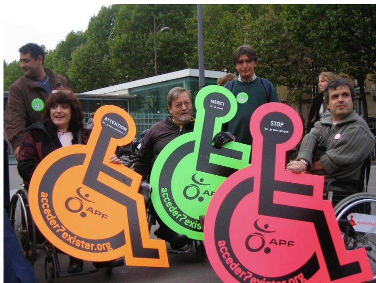
Fig. 1 - In 2008 in Paris, the Association des Paralysés de France is launching the 2nd edition of its 'Access to Exist' awareness campaign, one of the objectives of which is to denounce architectural barriers to the movement of people with disabilities. The principle of action is simple: implant life-size silhouettes whose color says the accessibility of the places. Green for easy access, orange for obstacle access, red for inaccessibility without external help.

Thinking on the accessibility of public urban space, and the adoption of a regulatory framework, was instigated in France in the 1970s by social unrest, in particular the revolt of the motor-disabled against architectural barriers to their movement. Such obstacles were numerous: raised platforms or steps at the entrance to many public buildings; steeply sloping or tilting streets; profusion of street furniture, often badly placed; pavements too high to be mounted by wheelchairs; and so on. The revolt gathered strength when the motor-disabled were joined by the sight-impaired, and then by a host of other people with difficulties getting about. The list of material constraints on movement grew longer, focusing attention on issues with urban signing and legibility. At the same time the disabled gained greater visibility, calling into question a society which had kept them out of the public eye, cloistered within specialist institutions (Fig.1). Furthermore, they raised the question, for an urban world, of how to obtain autonomy and social recognition and to develop their well-being through access to the city.